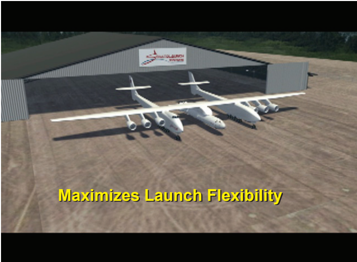
Maximizes Launch Flexibility