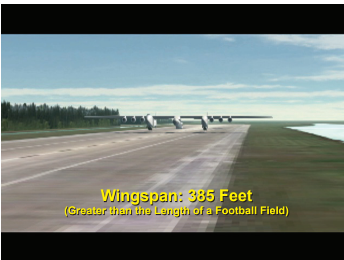
Wingspan: 385 Feet (Greater than the Length of a Football Field)