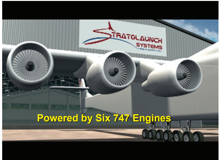
Powered by Six 747 Engines