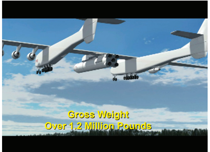
Gross Weight Over 1.2 Million Pounds