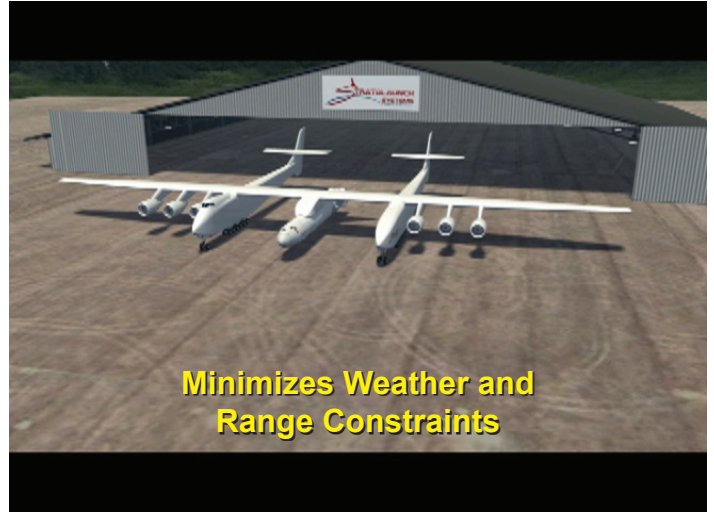
Minimizes Weather and Range Constraints