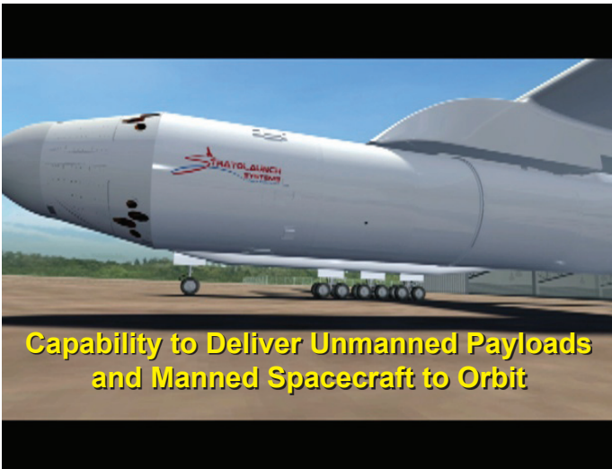
Capability to Deliver Unmanned Payloads and Manned Spacecraft to Orbit