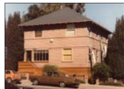
Photo painting after the "raising" early 1980s.