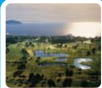
Porto Carras Sithonia