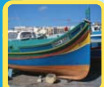
Gozo - Comino