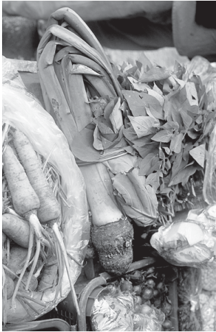
Figure 1 Upper: fresh corms with leaves, from cultivation, Banaue town market, Ifugao. Lower: Dried entire leaves (blades and petioles) hanging upside down, in street market, Manila city (plant sources unknown). Note the presence of darker- (purple) and lighter-coloured (green) petioles (leaf stems); the greater number of green bundles may reflect a greater abundance and general preference for green forms of wild taro