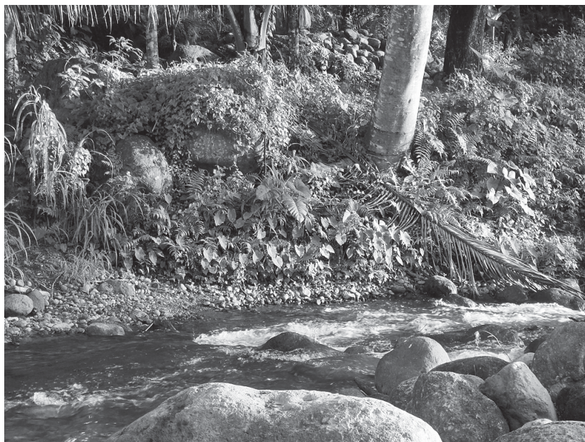
Figure 6 Wild taro on stream bank at edge of a coconut plantation, near Kidapawan, Mt Apo, Mindanao. The larger leaves in upper area of the taro patch belong to Xanthosoma sagittifolium , a South American root crop that is now naturalised (wild) in many locations in the Philippines