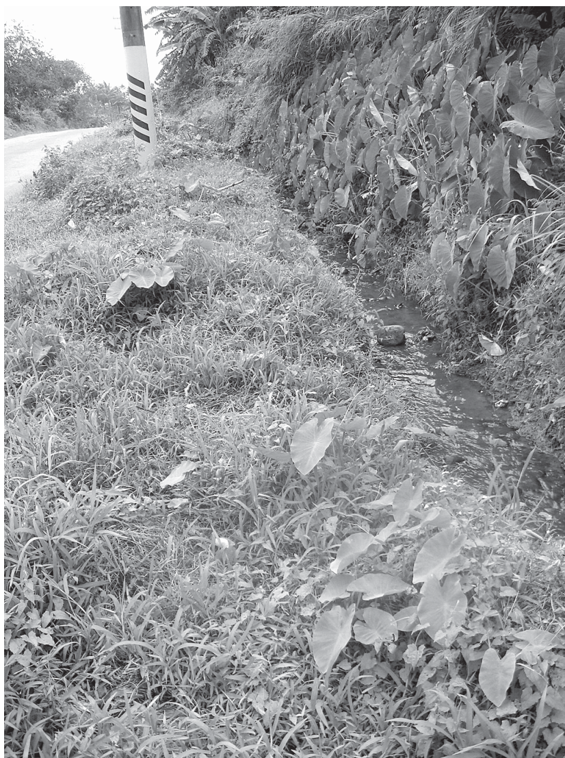
Figure 4 Wild taro growing alongside a wet ditch, at left, between the road and a field with taro. The wild and cultivated forms are morphologically distinct, and are managed differently. The wild form is a source of leaves for eating, and was not planted, according to the farmer using the field. The cultivated form on bank at right is a source of corms. Vic. Mt Banahaw, Luzon.

wild or cultivated, that is used as a source of leaves for cooking, while the name gabi puti or just puti (white) may be common for the green form that is pale or white near the base of the petiole. The name gabi puli was also mentioned in relation to wild taro in the vicinity of Lucban, and gabi bako was described there as a cultivated form grown for its corms. This suggests that the ‘ gabi bako ’ growing wild around Lake Sampoloc, and used occasionally for