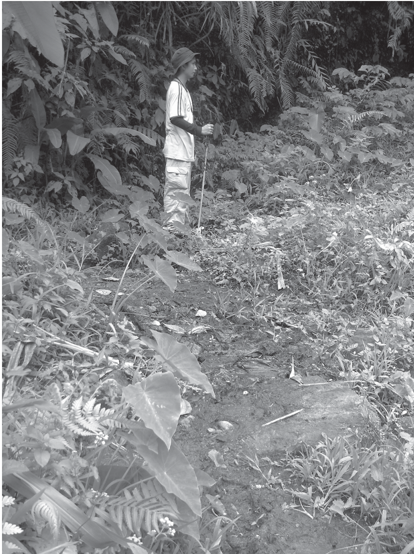
Figure 7 Wild taro growing in mud next to a seepage spring, above the Malbour River, Mt Apo, Mindanao

explained that she had seen wild taro on rivers in the mountains, and that these vary in their appearance. We continued further uphill to a hot spring and lake (L. Agko) at approx. 1,280 m. A small patch of wild taro (apparently wildtype) grew in a stream below the lake, next to an area with public pools and some gardening activity. In a nearby valley, at a similar altitude, we followed a foot trail along the Upper Malbor river, accompanied by a farmer who was tending a distant garden located on a large talus slope above the river. Further patches of wild and apparently wildtype taro (entirely green, with stolons) were found growing in seepage springs between the hillside and river bank (Fig. 7). The farmer explained that wild taro also