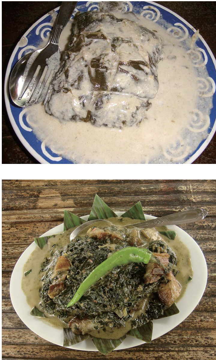
Figure 8 Two popular dishes in which taro leaves are cooked with coconut milk and other ingredients. Upper: pinangat . Lower: laing .

Similar reports were found in food and cooking books published in the Philippines. Cordero-Fernando (1992) wrote at length on the itchiness of leaves in the Bicol region, after interviewing people in a variety of professions: