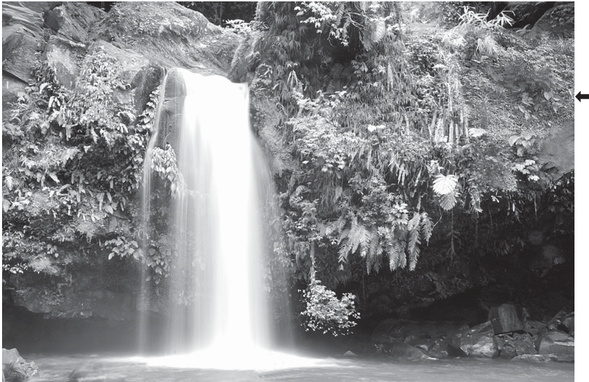
Figure 5 Wild taro (at upper right) alongside one of the Taytay Falls, Mt Banahaw. Earlier photos of the same waterfall show that the taro has colonised the edge of a small slip face, along with other wild herbs. (Photo Oct. 2008, courtesy D. Mateo)

corms, might have been transferred from gardens. People questioned near Mt Banahaw generally preferred the leaves of wild forms that lack purple petioles, as in the vicinity of Lake Sampoloc. One speaker also preferred using X. sagittifolium with a green rather than purple petiole, despite the fact that the petiole of this aroid is not eaten (the corms are commonly eaten). At B. Maloa, the name inaw was recorded as a local vernacular name for gabi in general.