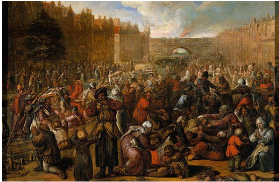
Otto van Veen: Relief of Leiden (1574), Inundated meadows allow the Dutch fleet access to the Spanish infantry positions.