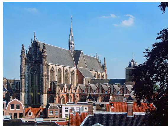
Hooglandse Kerk, Leiden

The chief of Leiden's numerous churches are the Hooglandse Kerk (or the church of St Pancras, built in the 15th century and containing a monument to Pieter Adriaansz. van der Werff) and the Pieterskerk (church of St Peter (1315) with monuments to Scaliger, Boerhaave and other famous scholars. From a historical perspective the Marekerk is interesting too. Arent van 's Gravesande designed that church in 1639. Other fine examples of his work in Leiden are in the Stedelijk Museum De Lakenhal (the municipal museum of fine arts), and the Bibliotheca Thysiana . The growing town needed another church and the Marekerk was the first church to be built in Leiden