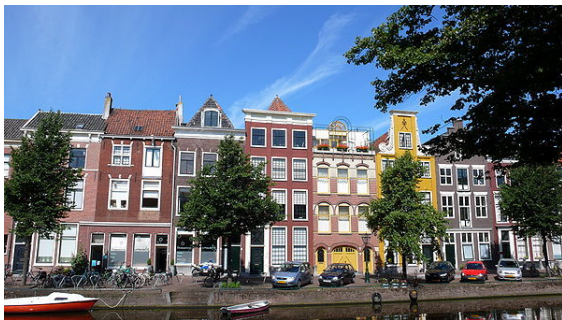
17th-century houses along the Herengracht.