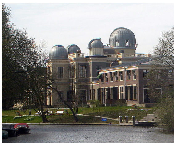
The 1860 Leiden Observatory, after restoration (2013)

The town centre contains many buildings that are in use by the University of Leiden. The Academy Building is housed in a former 16th-century convent. Among the institutions connected with the university are the national institution for East Indian languages, ethnology and geography; the botanical gardens, founded in 1587; the observatory (1860); the museum of antiquities ( Rijksmuseum van Oudheden ); and the ethnographical museum, of which P. F. von Siebold's Japanese collections was the nucleus ( Rijksmuseum voor Volkenkunde ). The Bibliotheca Thysiana occupies an old Renaissance building of the year 1655. It is especially rich in legal works and vernacular chronicles. Noteworthy are also the many special collections at Leiden University Library among which those of the Society of Dutch Literature (1766) and the collection of casts and engravings. In recent years the university has built the Bio Science Park at the city's outskirts to accommodate the Science departments.