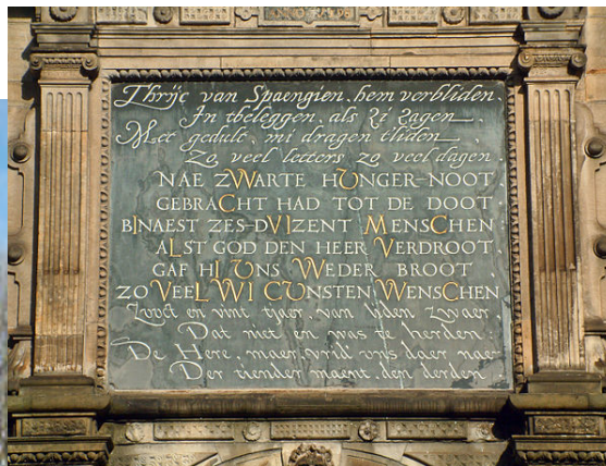
The poem on Leiden's Stadhuis.