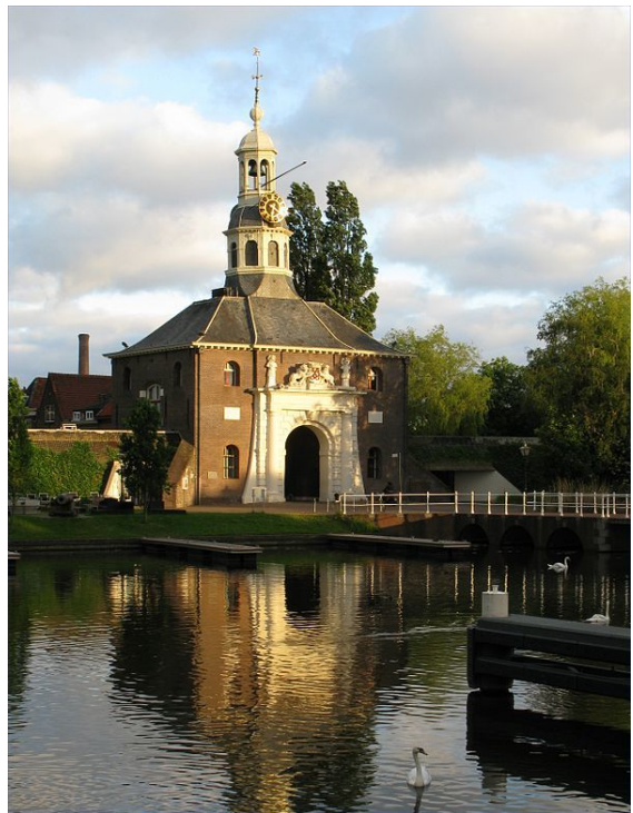
Leiden's east gate, the Zijlpoort