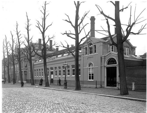
The 1852 Sijthoff printing office, Leiden