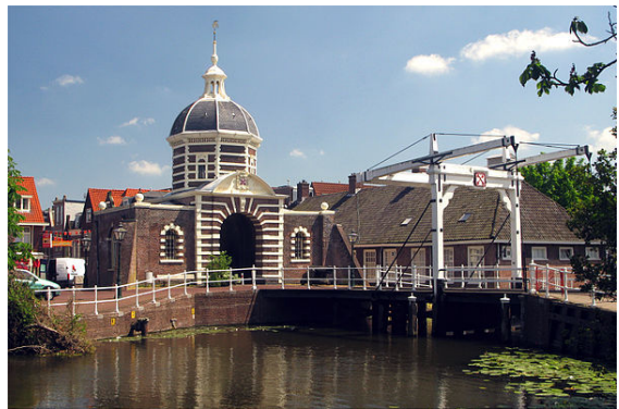
Leiden's west gate, the Morspoort