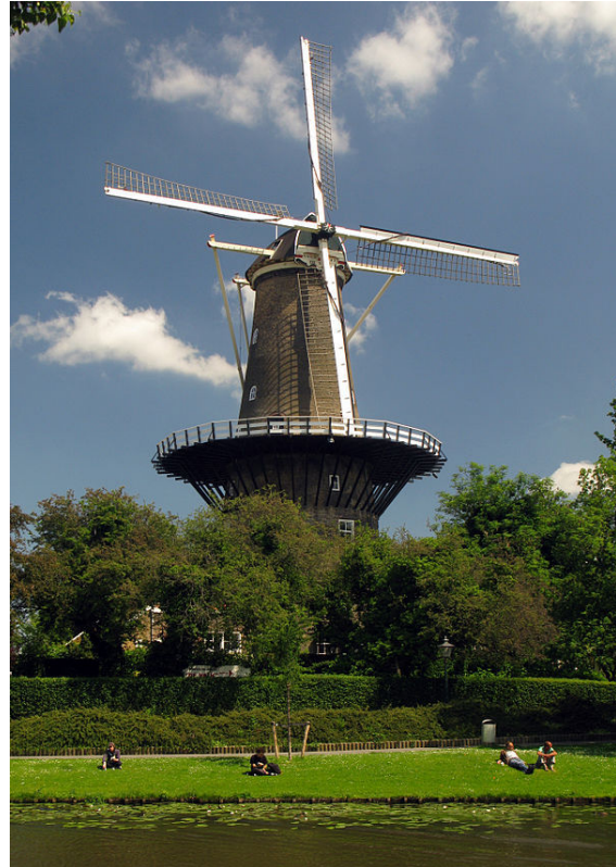
Windmill museum De Valk

Leiden was sacked in 1047 by Emperor Henry III . Early 13th century, Ada , Countess of Holland took refuge here when she was fighting in a civil war against her uncle, William I , Count of Holland . He besieged the stronghold