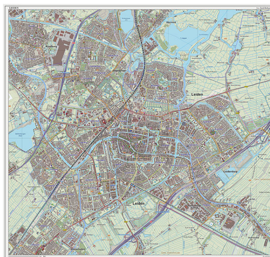
Topographic map image of Leiden (city), Sept. 2014