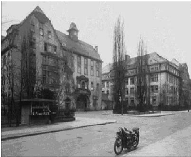
Figure 1 Hospital in Frankfurt am Main, Germany, where Dr Ludwig Rehn performed the worldwide first successful heart operation.