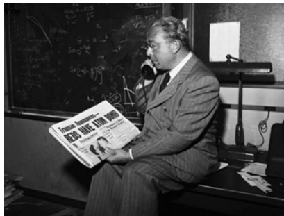
Leo Szilard, elected 1954.