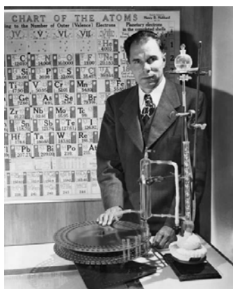
Glenn Theodore Seaborg, elected 1958.