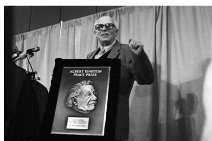
Andrei Dmitriyevich Sakharov, elected 1969, FHM.

Saint Gaudens, Augustus (1848-1907) Election: 1896, Associate Fellow Affiliation at election: New York, NY Residence at election: New York, NY Career description: Artist (sculptor)