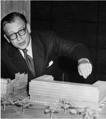
Eero Saarinen, elected 1954.

Election: 2012, FHM Affiliation at election: Paris, France Residence at election: Paris, France Career description: Musician (composer) Current affiliation: Same