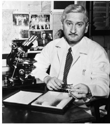
Albert Bruce Sabin, elected 1955.

Election: 2000, Fellow Affiliation at election: University of California, Los Angeles Residence at election: Los Angeles, CA Career description: Historian; Educator Current affiliation: Same