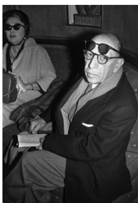
Igor Fyodorovich Stravinsky, elected 1940, FHM.