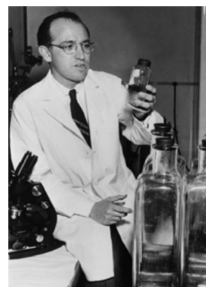
Jonas Edward Salk, elected 1966.

Salisbury, Harrison Evans (1908-1993) Election: 1969, Fellow Affiliation at election: New York Times Residence at election: New York, NY Career description: Journalist; Editor