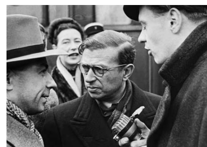
Jean-Paul Sartre, elected 1960, FHM.

Election: 1975, FHM Affiliation at election: University of Florence Residence at election: Florence, Italy Career description: Political scientist; Educator Current affiliation: Columbia University