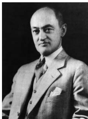
Joseph Alois Schumpeter, elected 1933.