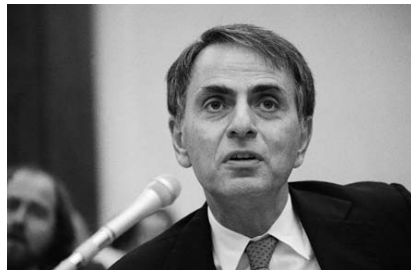
Carl Edward Sagan, elected 1978.