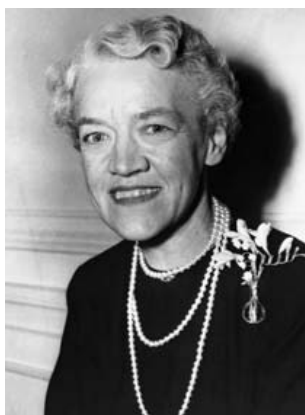
Margaret Chase Smith, elected 1952.