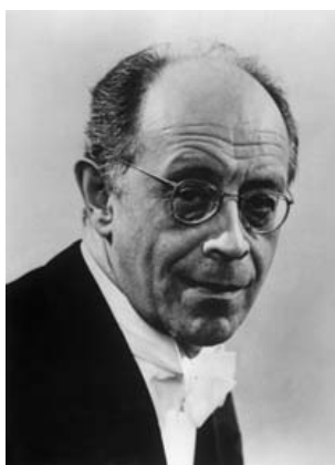
Rudolf Serkin, elected 1960.