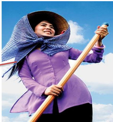
Áo bà ba