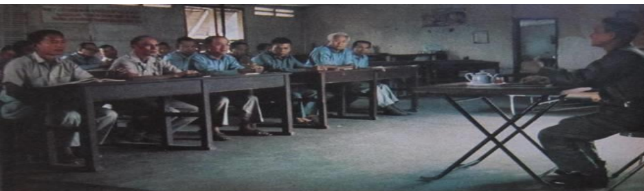
"Re-education" session for 26 generals of former South Vietnamese army. Second from left is onetime Defense Minister Nguyen Huu Co. (Below) Lower-ranking officers at another re-education camp.