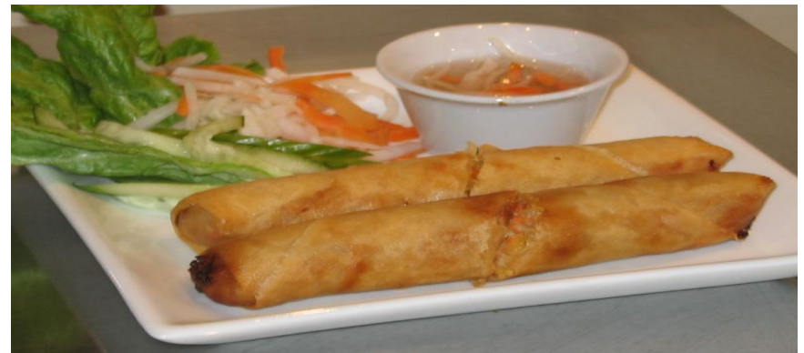
“Cha Gio” – Vietnamese Spring Rolls