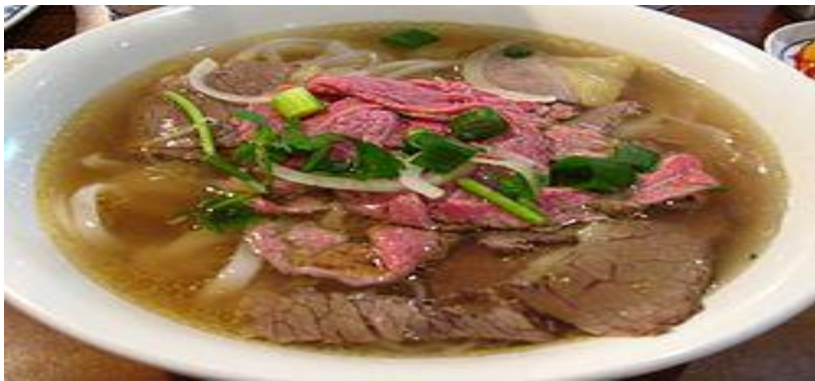
Pho – Vietnamese Noodle Soup