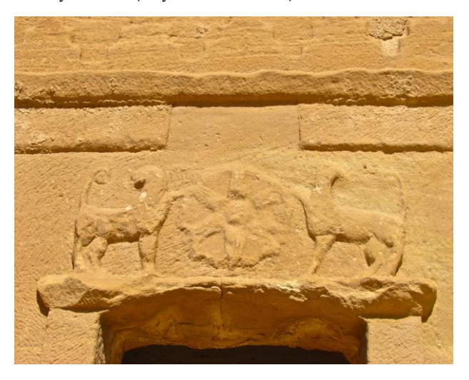
Fig.3: McKenzie 1990, Pl 12 d.

It has, in the funerary context, some special significance; it may be a tomb guardian, as courageous creatures, and it may also symbolize courage or death as a destructive creature (Glenys, 1978: 203-224; Seirnge, 1988). Strong (1915, 192-194) suggests that the lion represented the element of fire which purified the soul, while Toynbee suggests that Lion is a symbol of ravening power of death and man's victory over it (Toynbee, 1973: 65)