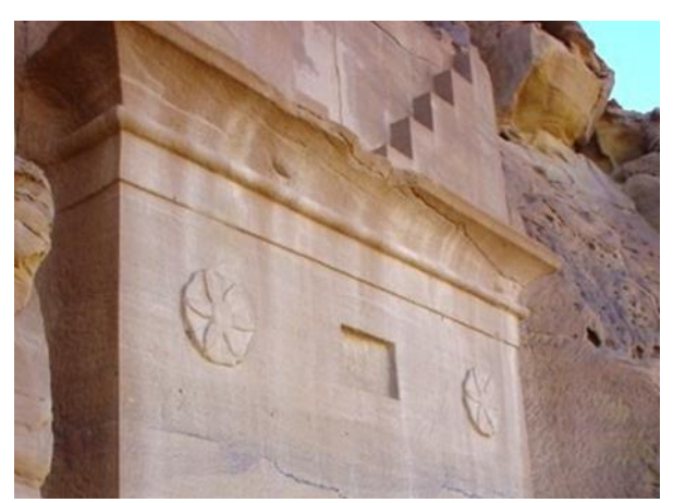
Fig. 4: McKenzie, 1990, Pl. 7d

it symbolizes immortality and eternal life and the Holy Spirit which radiates in all directions (Novakova, 2014: 226). The Rosette in relief were found in many tomb facades from Petra and Hegra (McKenzie, 1990, plats. 2d, 7d, 9d)