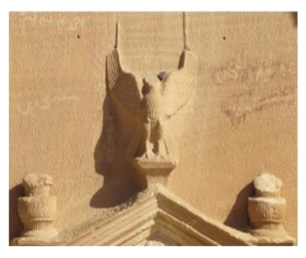
Fig. 3: : McKenzie 1990, Pl 10 C.

Allusion to apotheosis symbolizing the passage of the soul to the celestial regions where it becomes divine. Falcons had a special position in the Nabatean culture; they were regarded as the only animals not bound to earth by god. They could fly high up to reach god and seen as connecting people with the deity. Therefore falcons represented on tomb facades as guardians of the death toward any intruder