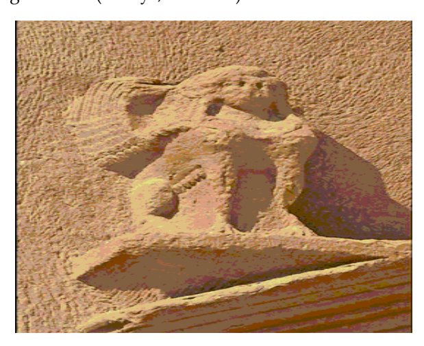
Fig. 5: McKenzie 1990 Pl. 2D.

This symbol appears only in one Nabatean tomb façade from Hegra (Glueck, 1966: 242, Pl. 8a). Sphinxes had been used to decorate funerary monuments; they are often said to be apotropaic or to act as guardians (Glenys,1978: 247).