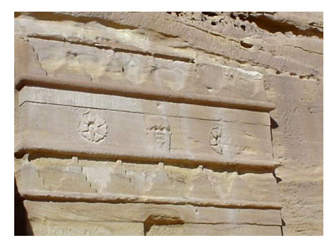
Fig.6: McKenzie 1990, Pl 14 A.

It is sculpted in relief in one tomb façade and in various niches at Hegra as an expression of immortality. According to Glueck (1966: 242), masks serve the belief that the wearer becomes united with the god through his everlasting life