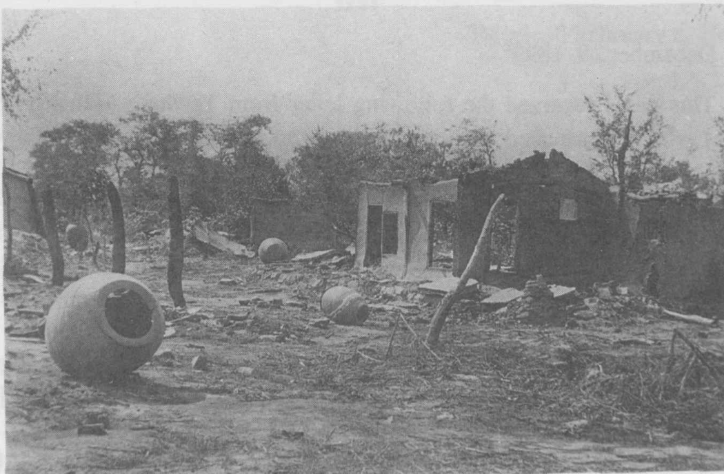
Aftermath of the Battle of Pyongyang, 15 September 1894.