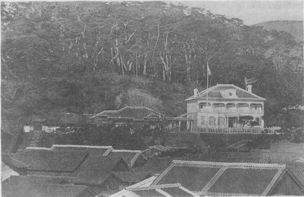
The Japanese embassy in Seoul, circa 1890.