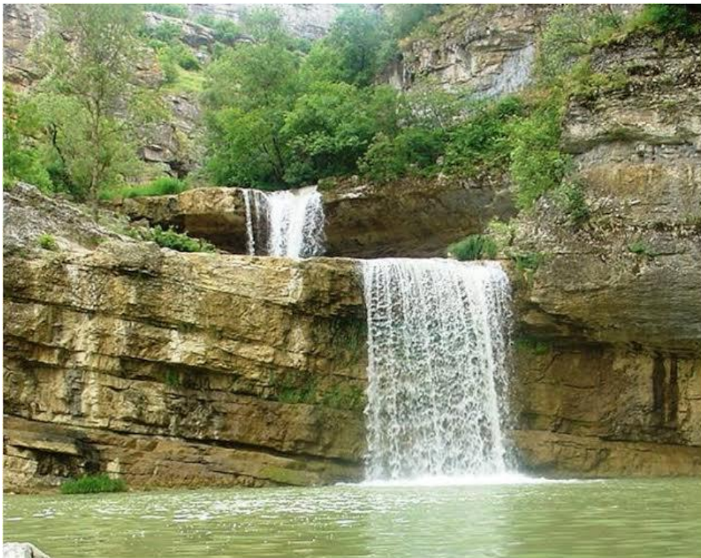
Figure 1. Mirusha Waterfalls- one of the most beautiful protected site network in Kosovo

The 1986 Law on national park „Sharr Mountain“ in December 2012 was replaced by a new law on national park „Sharri“ (Law on national park “Bjeshket e Nemuna” 2011), which extends protected areas from 39,000 ha as it was in the previous law, to 53,469 ha with the description „territory with natural values and rarities, preserved forests, the high number of important forest and other ecosystems, with high number of endemic and relics species, with rich geomorphologic, hydrological features, and with scientific, cultural, historic, landscapes, sports, tourism and recreation and activities that contribute to economic development with ecological criteria“. The territory of “Sharri” national park lies in south of