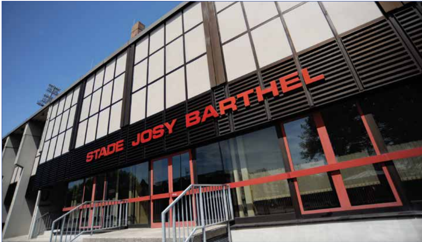
Main entrance to the Josy Barthel Stadium