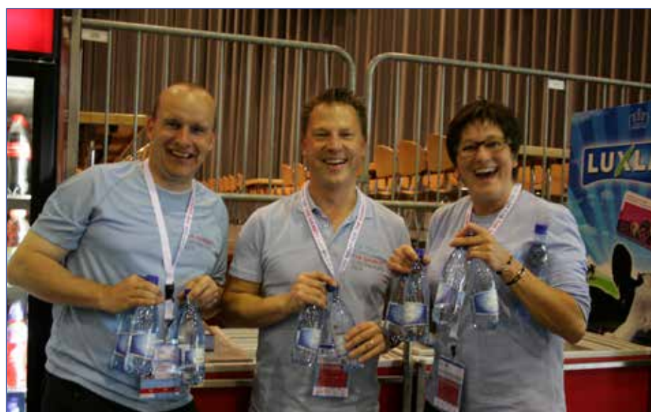
Main Catering Center in Limpertsberg Hall Victor Hugo

The volunteers are responsible for clearing tables and sorting rubbish into the recycling bins during lunch, which is served from 11am to 3 pm and dinner, from 6pm until 9.30 pm. They will also get a chance to taste the food being dished up as will other people volunteering for the Games, who can travel to the venue using the free shuttle bus service provided daily. "The