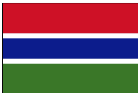
Image 1: The flag of The Gambia.

The geographical features are also reflected in the national flag. Red symbolises the sun, blue the Gambia River, green agriculture, white peace and unity: (10)