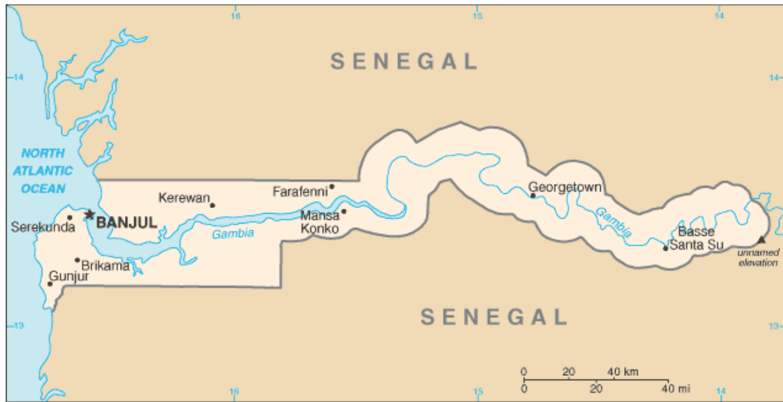
Map 1: CIA (Central Intelligence Agency). (6)