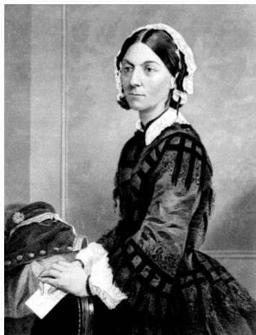
FIGURE 2-5 Florence Nightingale.

After reading a series of correspondence from the London Times in 1854 on the plight of wounded soldiers fighting in the Crimea, Nightingale asked the British secretary of war to let her work in military hospitals at Scutari, Turkey. In addition to granting her permission, he also designated her head of an official delegation of nurses. Nightingale worked for the next 2 years to improve the sanitary conditions of army hospitals and to reorganize their administration. The Times immortalized her as the “Lady with the Lamp” because she ministered to the soldiers throughout the night.