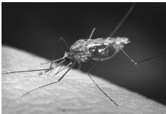
FIGURE 2-6 It has been said that of all the people who ever died, half of them died from the bite of the mosquito. For thousands of years it was not known that the mosquito was responsible for diseases such as yellow fever and malaria. These two diseases are still not fully contained in many parts of the world. In 1900, Walter Reed, M.D., a U.S. Army physician working in the tropics, made the epidemiological connection between the mosquito ( Aedes aegypti species) and yellow fever.

The infectious nature of yellow fever was established in 1900 ( Figure 2-6 ). In 1902, the United States Public Health Service was founded, and in 1906, the Pure Food and Drug Act was passed. Standard methods of water analysis were also adopted in 1906. The pasteurization of milk was shown to be effective in controlling the spread of disease in 1913, and in this same year, the first school of public health, the Harvard School of Public Health, was established. 24,25