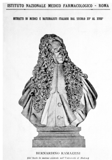
FIGURE 2-4 Bernardino Ramazzini.

Bernardino Ramazzini (1633–1714) was born in Carpi near Modena, Italy (Figure 2-4). He received his medical training at the University of Parma and did postgraduate studies in Rome. Ramazzini eventually returned to the town of Modena, where he became a professor of medicine at the local university. He was interested in the practical problems of medicine and not in the study of ancient theories of medicine, a fact not well received by his colleagues. Through Ramazzini’s continuous curiosity and his unwillingness to confine himself to the study of ancient medical theories, he became recognized for his innovative approaches to medical and public health problems. For example, in 1692, at the age of 60, Ramazzini was