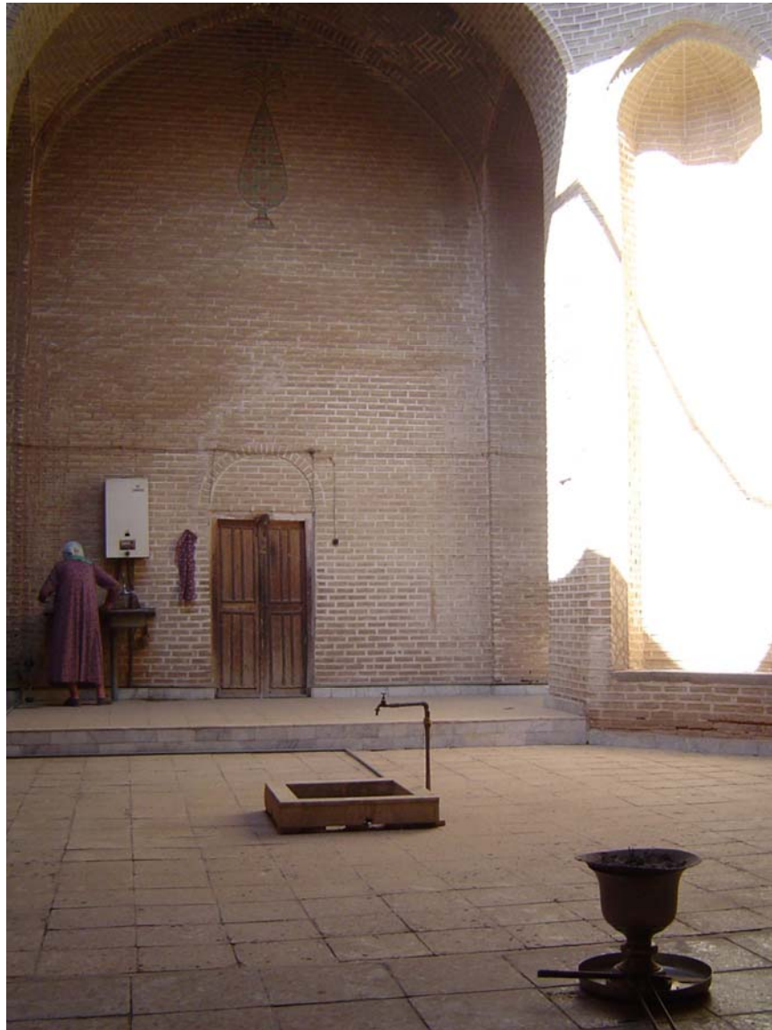
Plate 3. Inside the old ātaš kadēh (fire temple) we discovered by accident one day. The old woman caretaker has been looking after the temple for as long as most people living in the neighborhood can remember. The cedar painted on the wall above the door at the top of the picture is an extremely common Zoroastrian icon, symbolizing āshā , the good way of life.