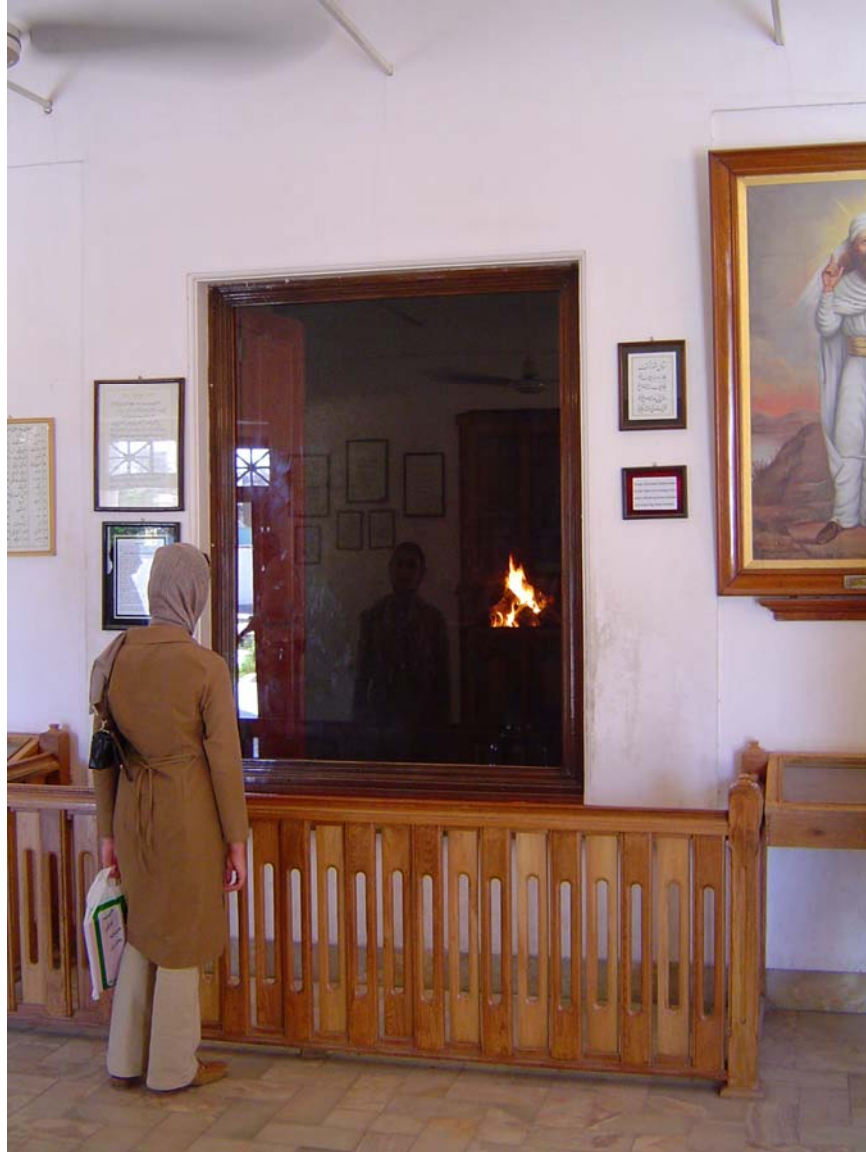
Plate 5. Inside the main ātash kadeh of Yazd. The fire housed behind the glass has been burning for over a thousand years and traces its lineage to one of the holiest fires of the ancient Persian empire.