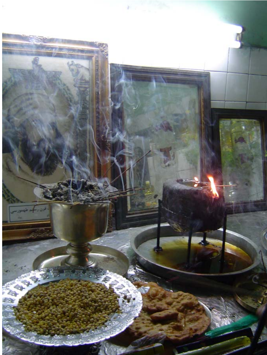
Plate 6. The offering table at the shrine in seti-pir , the only one of the six major pir located within the city of Yazd.. A variety of offerings have been made, including incense, dried chick peas, and suruk , a type of sweet, fried bread.