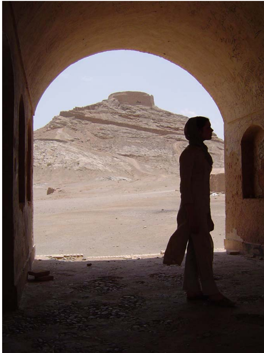
Plate 1. Exploring one of the old, abandoned buildings at the foot of the dakhme (funerary tower) on the outskirts of Yazd. This structure of mud and brick built high atop a hill was used up through the early twentieth century for the disposal of the Zoroastrians' dead. The dakhme are one of the most famous landmarks of Yazd, and also one of the most recognized aspects of Zoroastrianism. Unfortunately, today, the city of Yazd has expanded practically to the foot of the hill on which the dakhme is situated, making them a popular site of recreation for Muslim youth, who ride their motorcycles up and down the dakhme and vandalize them with graffiti. This, in combination with the city's rapid encroachment, make us fear that the dakhme are in danger of being destroyed.