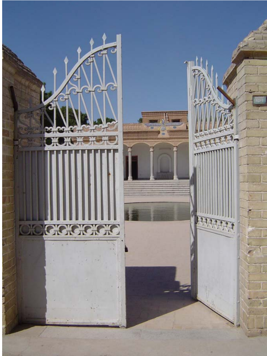
Plate 4. The door to the main ātaš kadeh of Yazd, slightly open in welcome. The main fire temple in Yazd is located in a beautiful park-like setting. The simple, yet elegant, oval pond creates a calm and soothing environment for andisheb (meditation, thought).