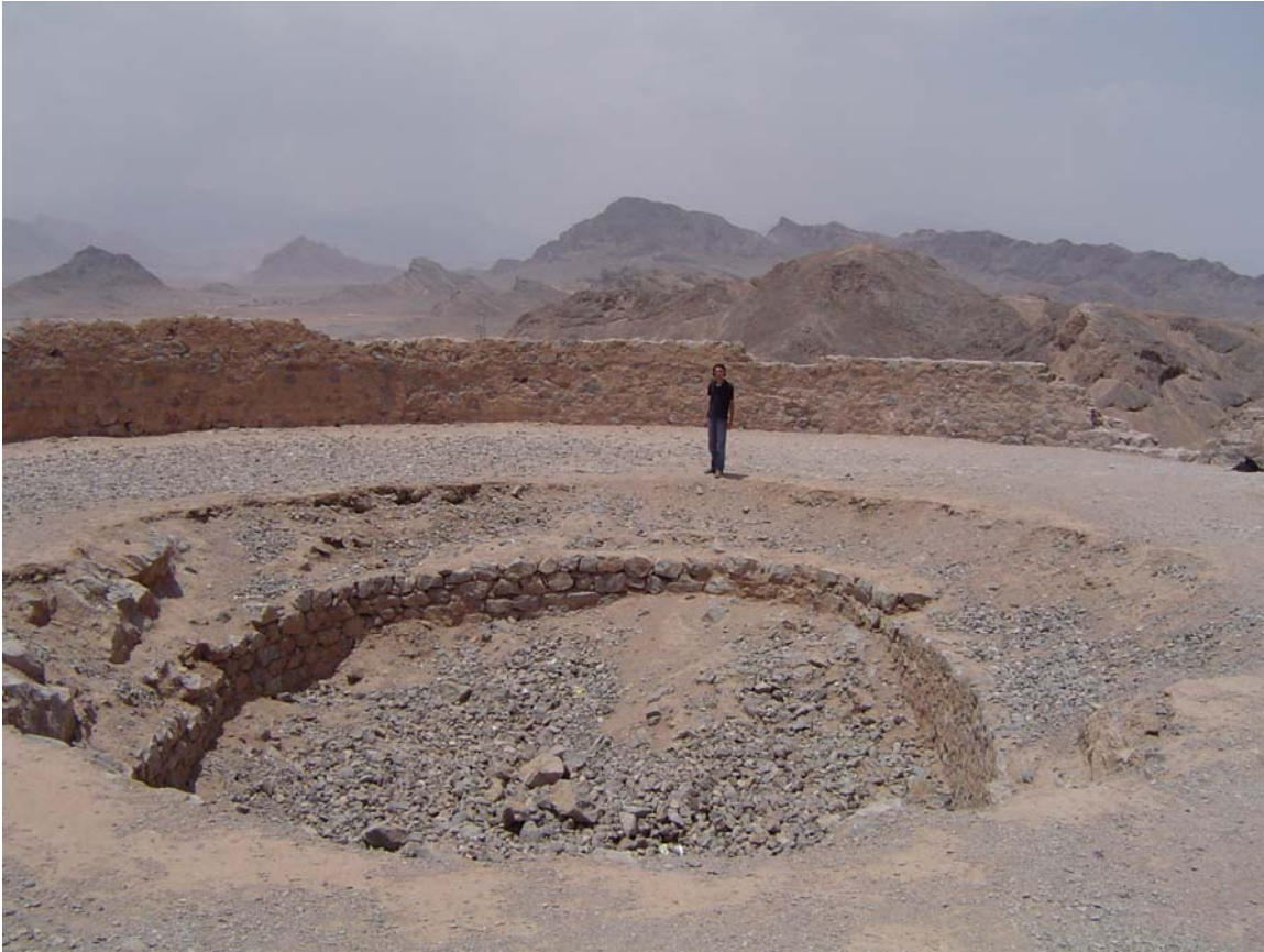
Plate 2. Atop the dakhme . Up through the nineteenth century, the Zoroastrian dead were brought here and exposed to the elements. At that time, the funerary towers were located far off in the desert, distant from civilization, in order to avoid contaminating the living through exposure to the corpses, which were considered unclean and therefore impure. After corpses had been stripped of flesh by vultures and their bones dried and bleached by the sun and driving wind, they were thrown into the ossuary pit in the center of the dakhme . When the tradition of exposure was discontinued in the twentieth century, the bones were removed to a regular cemetery located nearby.