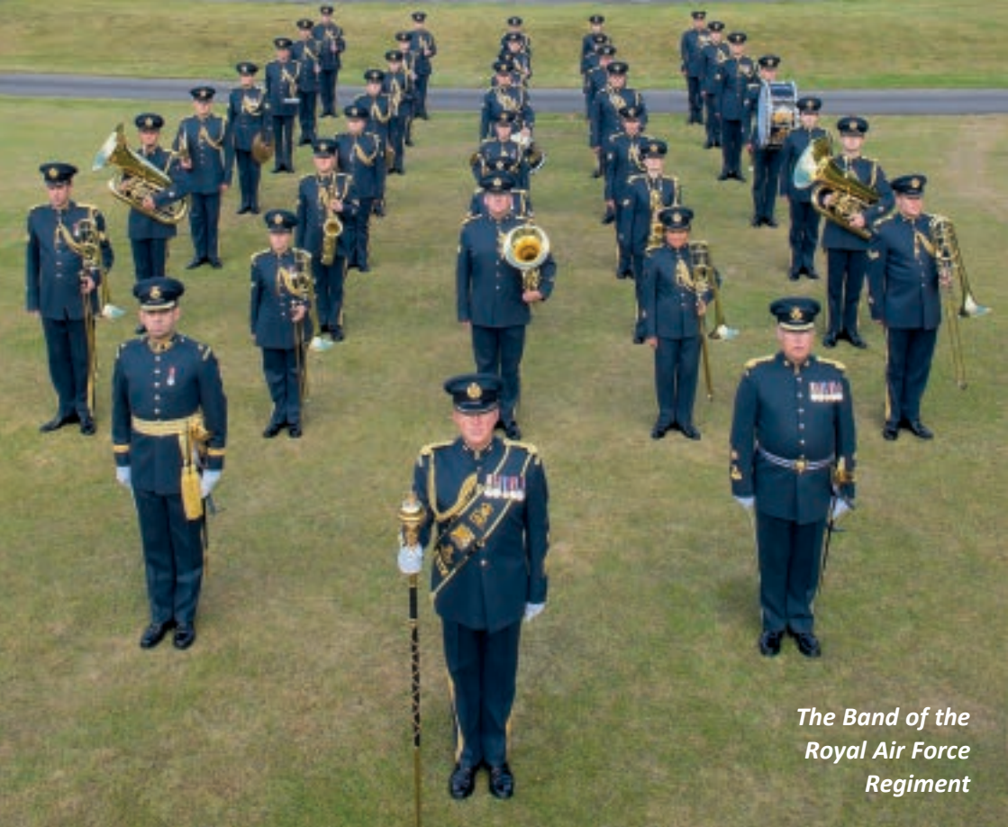
The Band of the Royal Air Force Regiment