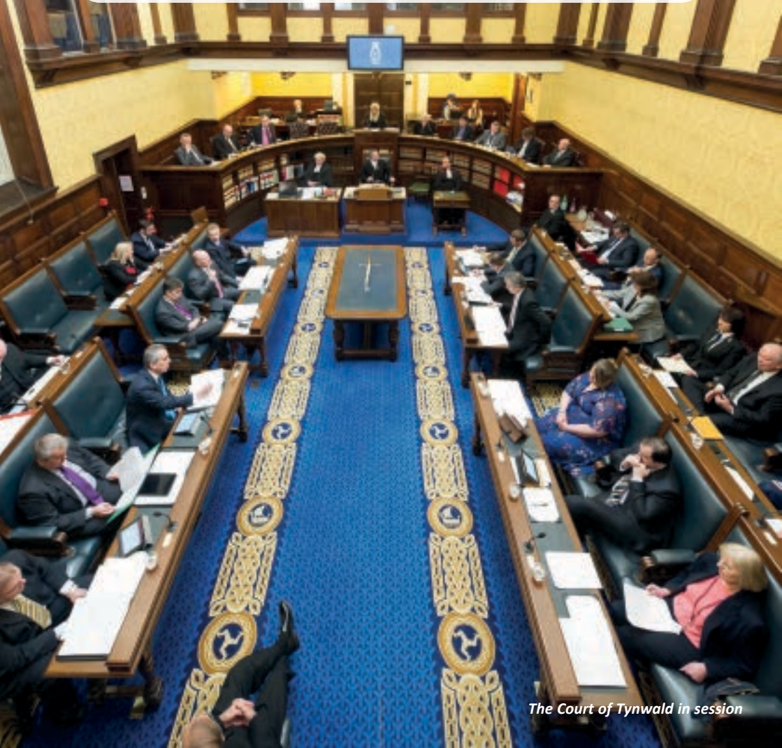
The Court of Tynwald in session

The ceremony is in three parts. It begins in the Royal Chapel with a service of worship at 11am. Then the Members of Tynwald and other participants move to Tynwald Hill where the Acts are promulgated and any petitions are brought forward. Finally, the Court returns to the Royal Chapel where the Acts are captioned.