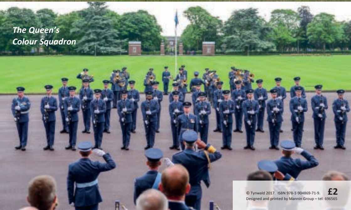
The Queen's Colour Squadron