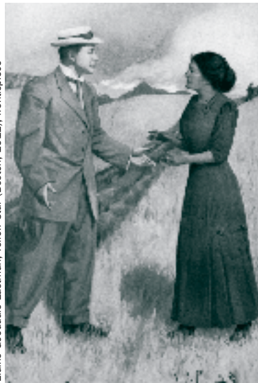
Elaine Gooddale Eastman, Yellow Star (Boston, 1911), frontispiece

28. Letter in James One Star, Carlisle Student Files, RN 1327, RG 75.20.3, NA.