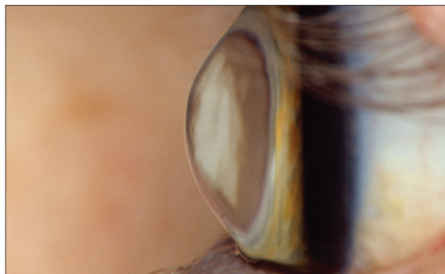
An eye with keratoconus.

The rate of progression varies. Keratoconus will often progress slowly for 10 to 20 years and then suddenly stop.