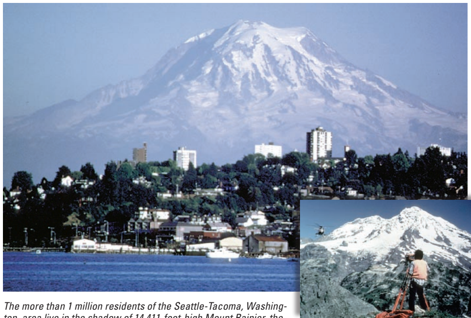
The more than 1 million residents of the Seattle-Tacoma, Washington, area live in the shadow of 14,411-foot-high Mount Rainier, the tallest volcano in the United States outside of Alaska. Several communities near the volcano, built on the deposits of giant lahars of volcanic ash and debris that are less than 1,200 years old, are at risk from similar future lahars. Inset photograph shows a U.S. Geological Survey (USGS) scientist monitoring the volcano for signs of subtle ground movement that might lead to an eruption or landslide.

When Cascade volcanoes do erupt, high-speed avalanches of hot ash and rock