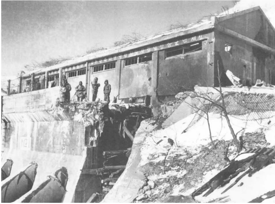
Department of Defense Photo (USMC) A5376

The Chinese had blown a critical bridge halfway down Funchilin Pass where water flowed downward from Changjin Reservoir and passed through four giant pipes called "penstocks." As early as 4 December, MajGen Smith knew that this 24-foot gap would have to be bridged if his vehicles were to reach Hungnam.