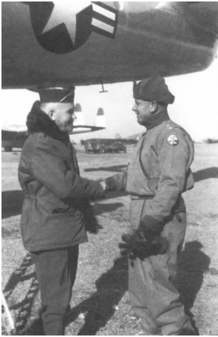
General J. Lawton Collins, the Army chief of staff, left, visited X Corps on 6 December and warmly praised MajGen Almond, right, for his conduct of the battle. Collins got to the command posts of the 3d and 7th Infantry Divisions, but bad weather kept him from seeing MajGen Smith and the command post of the 1st Marine Division at Koto-ri.

was concerned over the coordination of artillery fire by the 3d Division. Almond promised that it would be under Marine control. He spoke briefly with Puller and Litzenberg and noted that night in his diary, "Morale is high in the Marine Division."