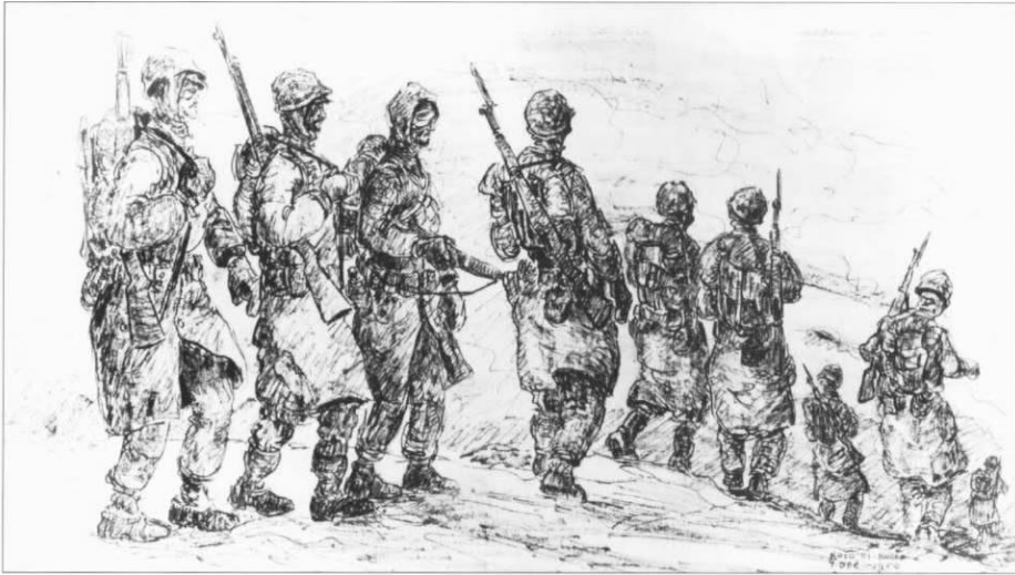
Sketch by Sgt Ralph Schofield, USMCR

Going downhill was easier for the most part than going up, but wherever it was the march was single file of Marines, or at best a double file. Even stripped down to essentials, the average Marine carried 35 to 40 pounds of weapons, ammunition, rations, and sleeping bag. Anything more, such as toilet articles, shelter half, or poncho, was a luxury.