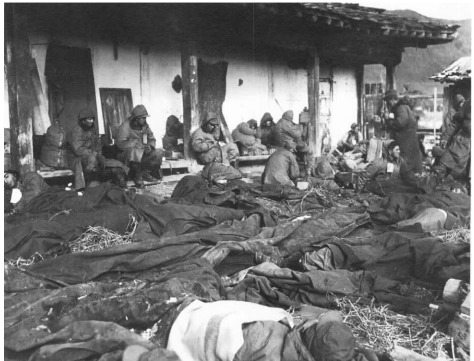
Photo by Sgt Frank C. Kerr, Department of Defense Photo (USMC) A4858

or the hospital ship Consolation in Hungnam harbor. Casualties expected to require more than 30 days hospitalization were flown on to Japan.