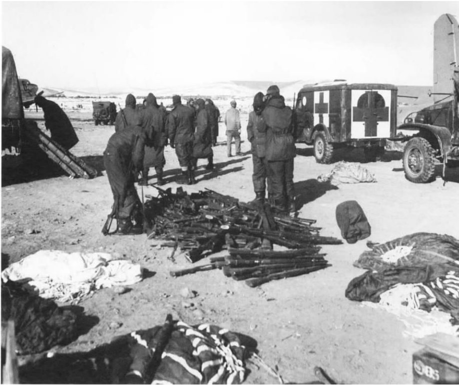
Photo by Sgt William R. Keating, Department of Defense Photo (USMC) A5683 Casualty evacuation from Hagaru-ri airstrip began on 1 December, although the condition of the field fell far short of what safety regulations required. Here, on a subsequent day, an ambulance discharges its cargo directly into an Air Force C-47 or Marine Corps R-4D transport. Weapons of other, walking wounded, casualties form a pile in the foreground.

Hagaru-ri was already stockpiled with six days of rations and two days of ammunition. The first airdrop from Air Force C-119 "Flying Box Cars" flying from Japan was on that same critical 1st of December. The drops, called "Baldwins," delivered prearranged quantities of ammunition, rations, and medical supplies. Some drops were by parachute, some by free fall. The Combat Cargo Command of the Far East Air Forces at first estimated that it could deliver only 70 tons of supply a day, enough perhaps for a regimental combat team, but not a division. By what became a steady stream of transports landing on the strip and air drops elsewhere the Air Force drove its deliveries up to a 100 tons a day.