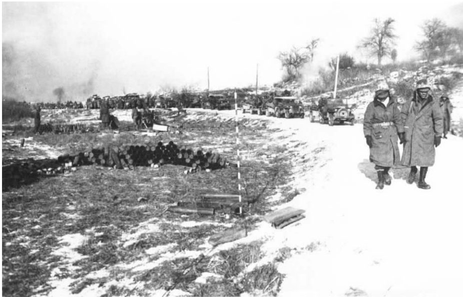
National Archives Photo (USMC) 127-N-A5666

In coming back from Yudam-ni, the 1st Marine Division's large number of road-bound wheeled vehicles was both an advantage and a handicap. They carried the wherewithal to live and fight; they also slowed the march and were a temptation for attack by the Chinese. Here an 11th Marines howitzer can be seen in firing position to cover the column's rear.