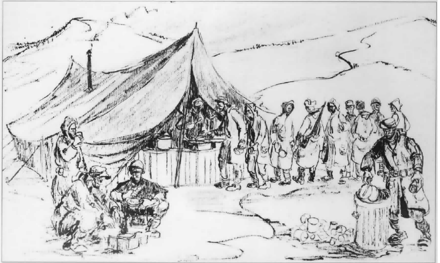
Sketch by Sgt Ralph Schofield, USMCR

The 5th and 7th Marines on arrival at Hagaru-ri combat base found hot chow waiting for them. The mess tents, operating on a 24-hour basis, provided an almost unvarying but inexhaustible menu of hot cakes, syrup, and coffee. After a few days rest and reorganization, the march to the south resumed.