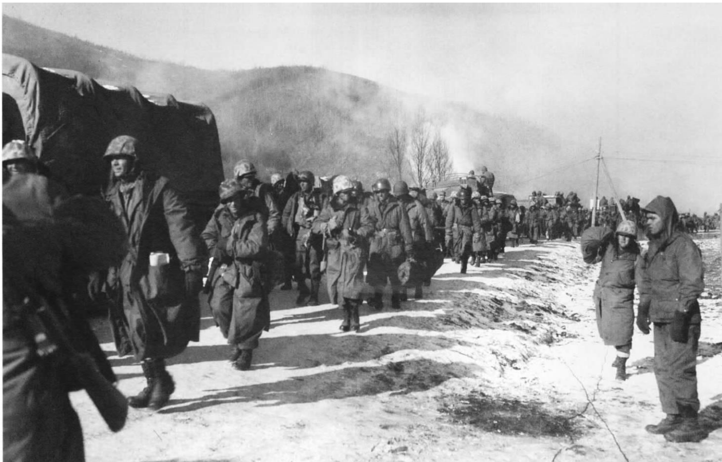
Marines depart Yudam-ni on 1 December. The general plan for the breakout was that the 5th Marines would follow the axis of the MSR and the 7th Marines would move overland.