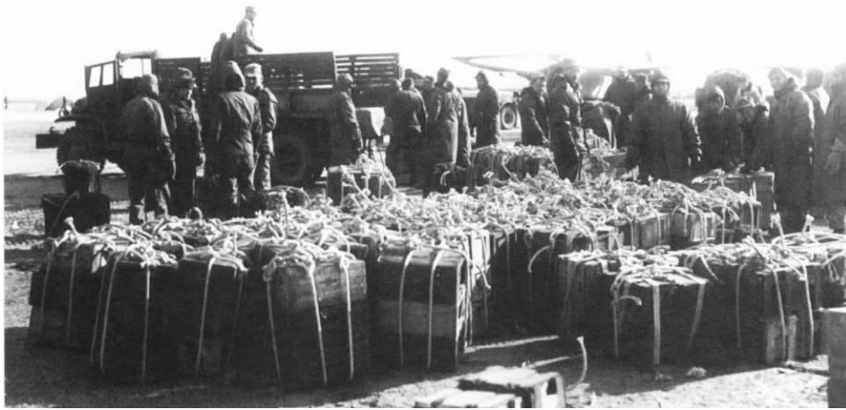
National Archives Photo (USA) 111-SC353607

Cases of ammunition are sorted out and lashed together at Yonpo airfield on 29 November before loading into C-47 transports of the Far East Air Force's Combat Cargo Command. This ammo was intended for RCT-31, better known as Task Force Faith, east of the reservoir. First airdrops directly from Japan would be to Hagaru-ri on 1 December.