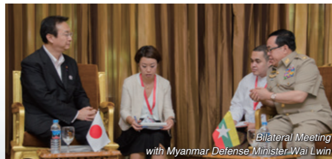
Bilateral Meeting with Myanmar Defense Minister Wai Lwin

On November 19th, Defense Minister Eto visited Myanmar where he attended the Japan-ASEAN Defense Ministerial Roundtable and held a bilateral defense ministerial meeting with Myanmar.