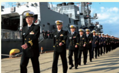
Departing Ceremony of 20th DSPE