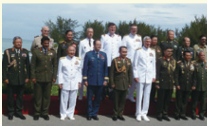
CHOD 2014 Conference