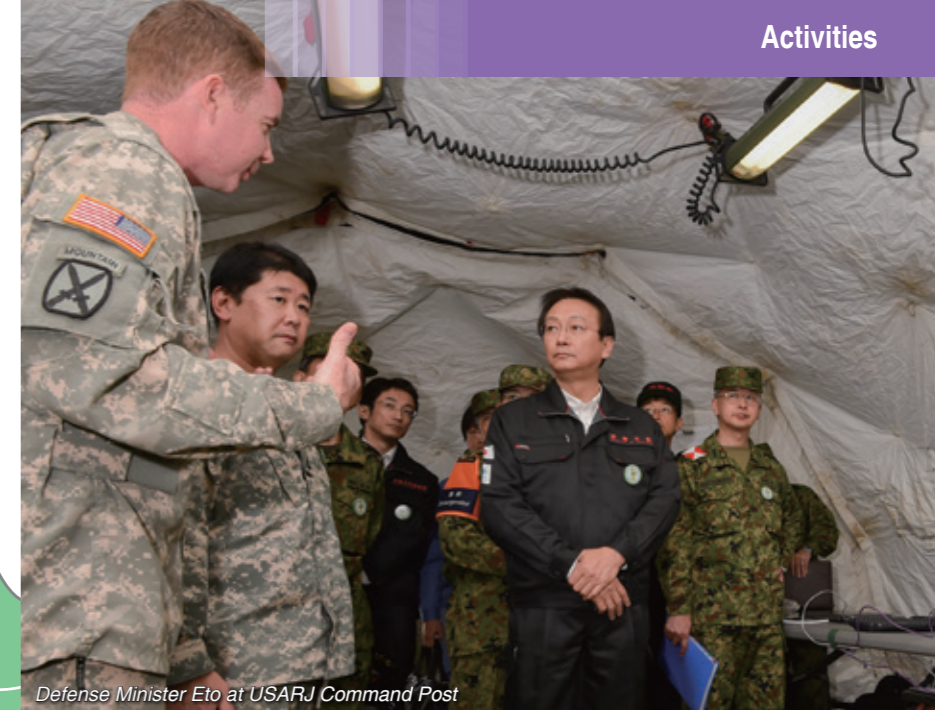
Defense Minister Eto at USARJ Command Post