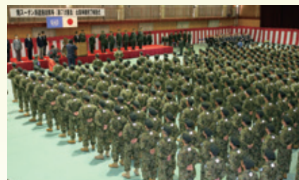
Send-off Ceremony of the UNMISS 7th Engineer Unit