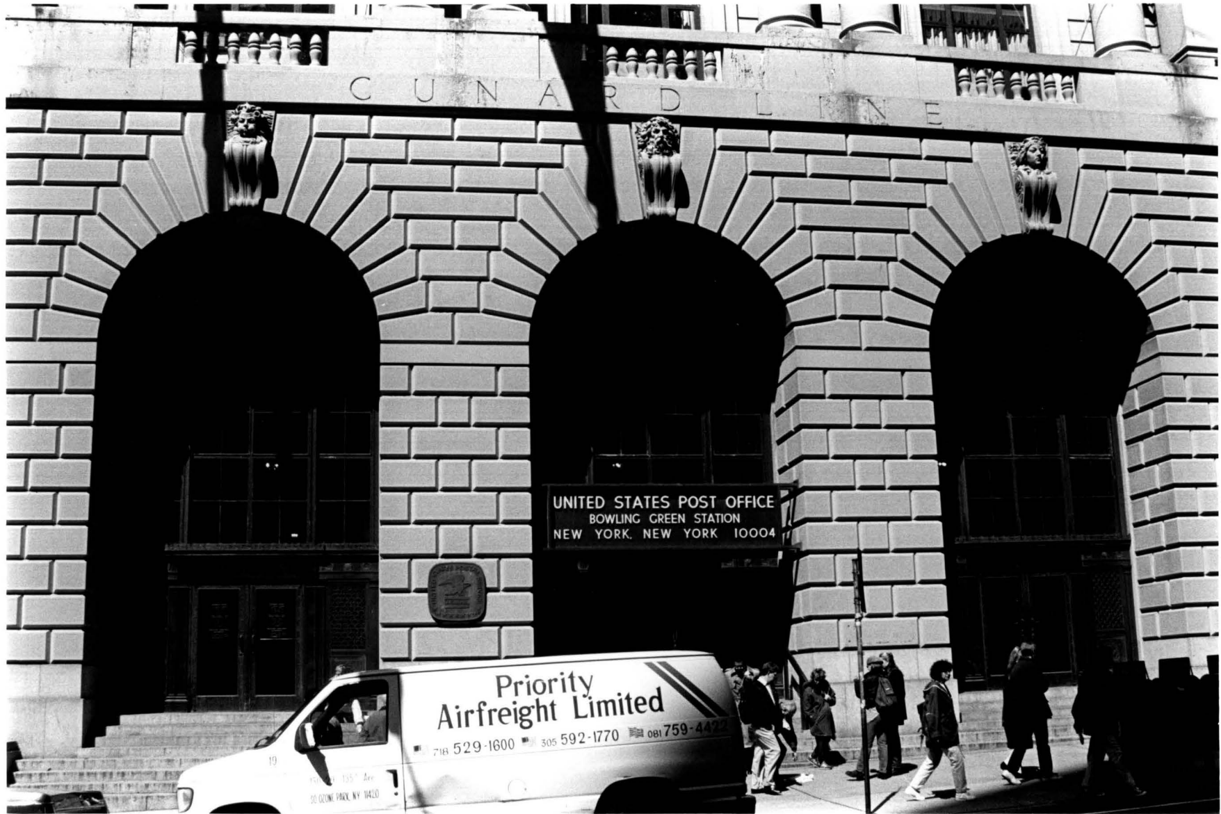
Fig. 3 Cunard Building, Detail of Broadway facade