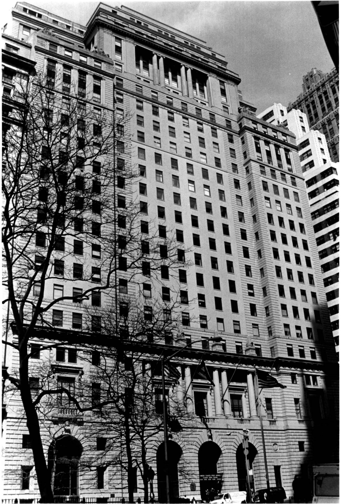
Fig. 2 Cunard Building, Broadway facade