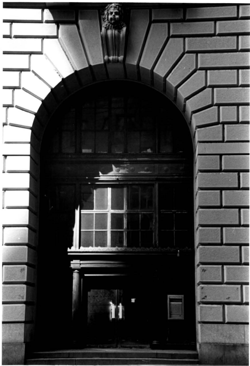
Fig. 4 Detail of northern bay on Broadway facade