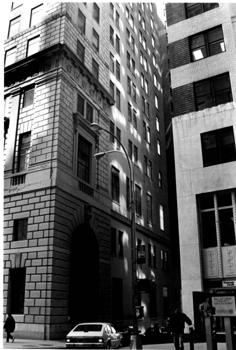
Fig. 5 Northwest corner of building and Morris Street elevation