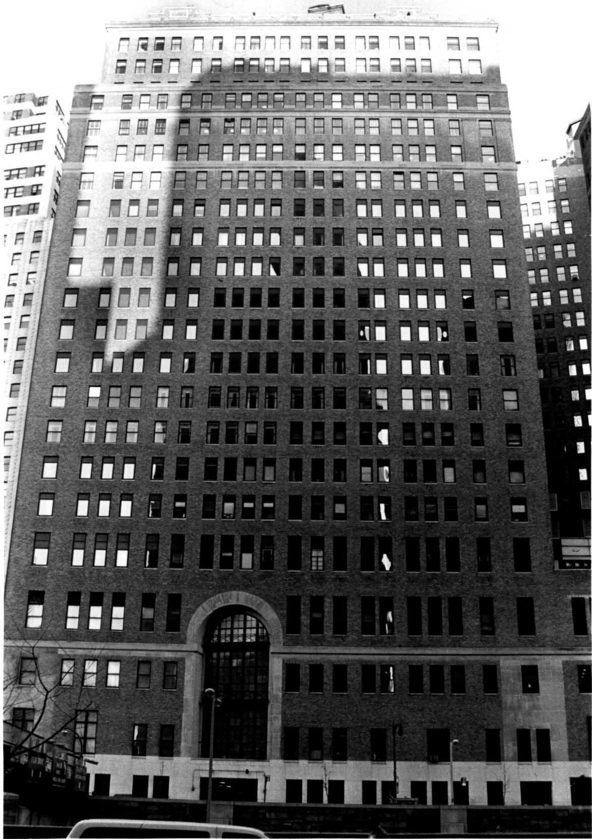
Fig. 6 Cunard Building, Greenwich Street elevation