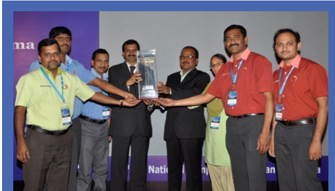
Winner Under Large Scale Manufacturer: Amara Raja Industrial Battery Plant