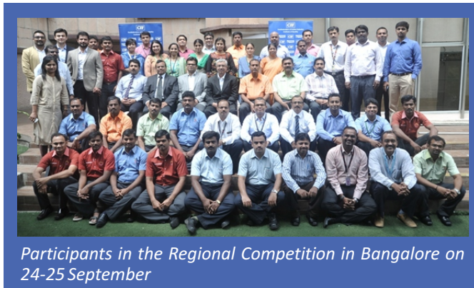
Participants in the Regional Competition in Bangalore on 24-25 September