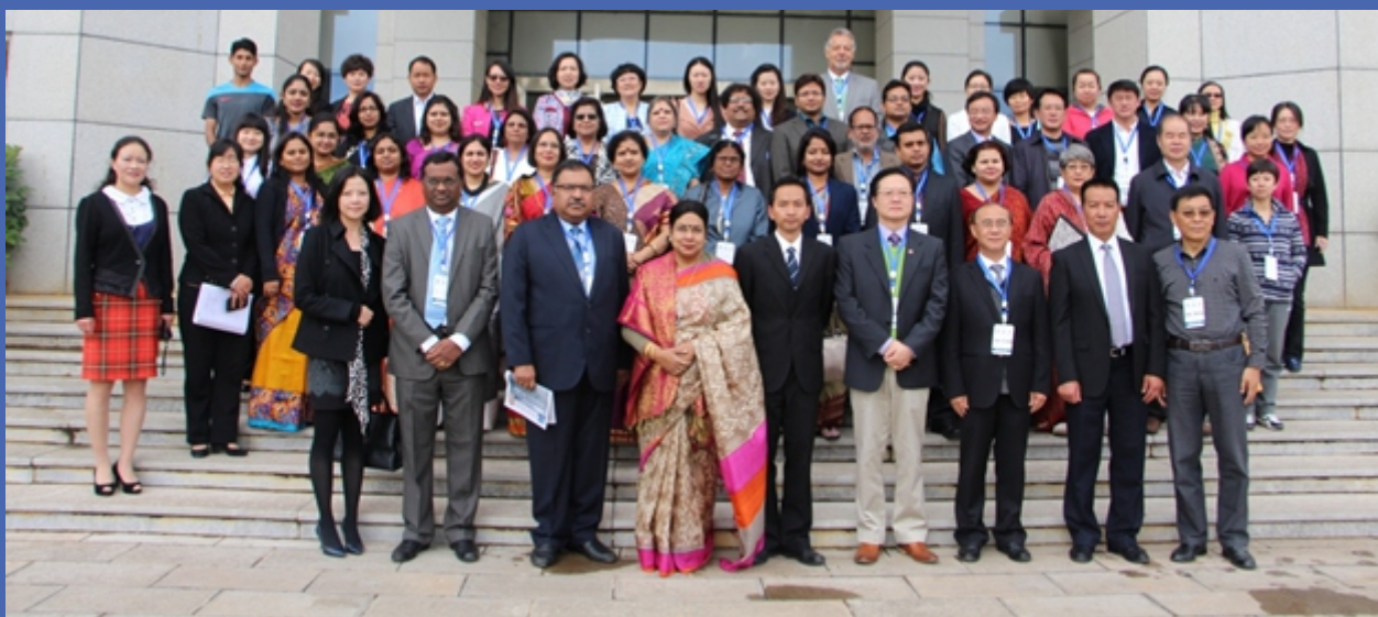
Delegates at the International Conference for Teachers at Kunming, China