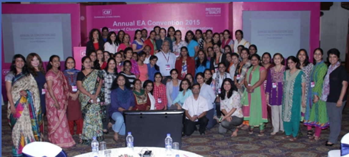
Participants in the Annual EA Convention 2015, Bangalore

The CII Institute of Quality organized the CII Annual EA Convention on 4-5 June 2015 at Bangalore with the theme “The Dance of Change - Building Value for the Organisations” which was attended by 85 participants from various industries and regions.