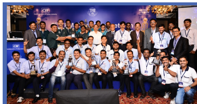
Winners of the 3rd TPM Circle Competition