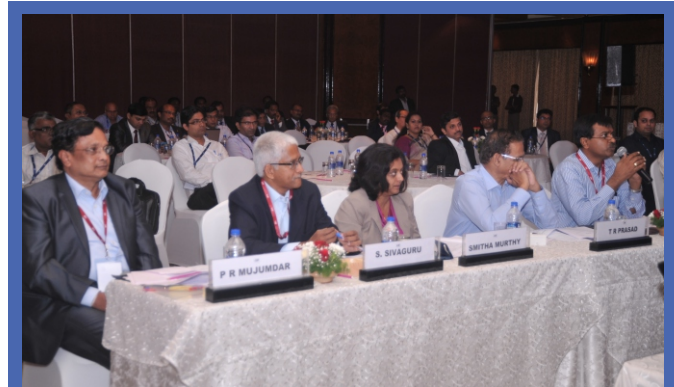
Jury members at the 3rd CII National Excellence Practice Competition

There were two competition themes open to both the manufacturing and services sectors. Under Supplier & Partner Engagement, from the manufacturing sector, Mahindra & Mahindra Ltd was the winner with Tata Steel as the 1st Runner up and Tractors and Farm Equipment Limited as the 2nd Runner up. Delhi International Airport Ltd was the winner in the services sector, with National Stock Exchange of India Ltd as the 1st Runner up and Max Life Insurance Co Ltd as the 2nd Runner up. Under the theme Community Engagement, under the manufacturing sector, Appliances Division, Godrej & Boyce Mfg. Co. Ltd was the winner with Bosch as the 1st Runner up and Tata Housing Development Company Ltd as the 2nd Runner up. In the services sector, the winner