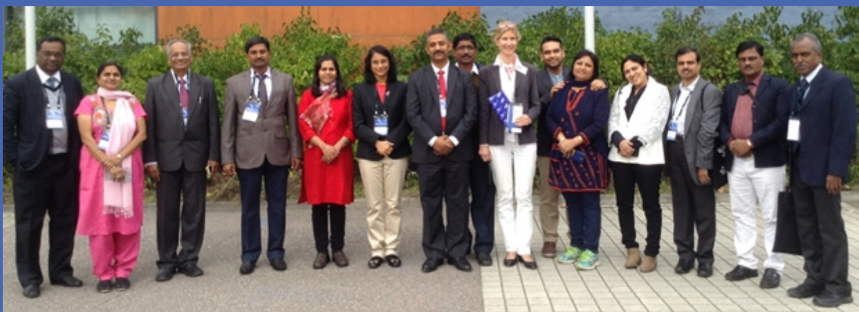
Delegation visiting Viikki Teacher Training School (primary, lower and upper secondary school), Helsinki, Finland

CII Institute of Quality, Education Excellence team organized its 3rd International School Excellence Mission and First to Finland from September 28 - October 1, 2015 in association with the Centre for Continuing Education, University of Helsinki.