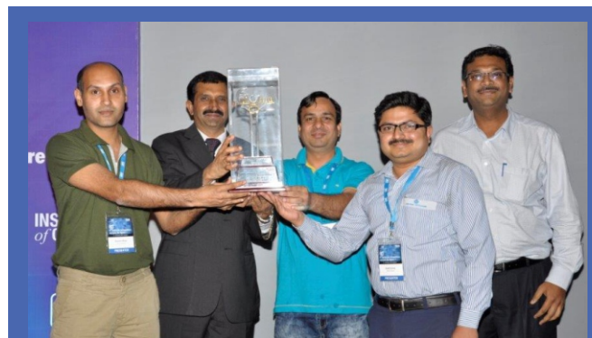
Runner up: Ashok Leyland