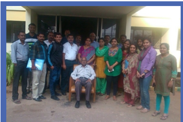
Participants at the Four day training programme on Laboratory Management & Internal Audit as per ISO 17025 held on 6-9 January, 2015 at Bangalore

The QMS Division conducted more than 60 trainings addressing over 1000 industry professionals on Quality