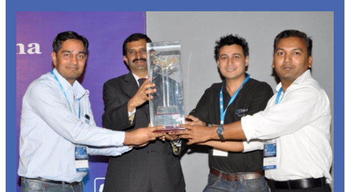
Winner Under Small Scale Manufacturer: KSPG Automotive India Private Limited