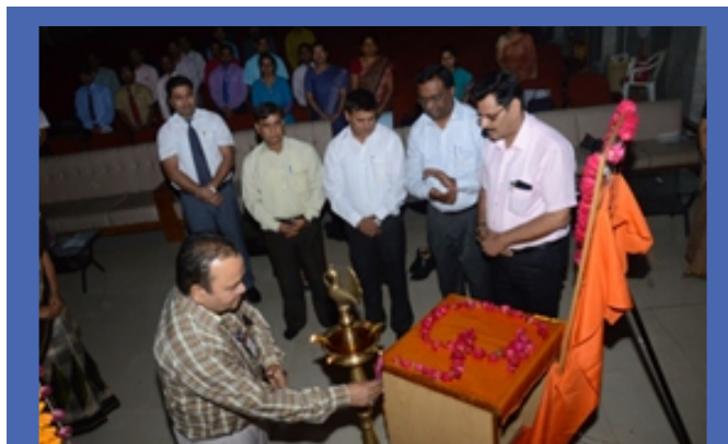
NTPC Officials and School Principals lightening the lamp at the Inaugural function, 16th April 2015

NTPC took a proactive step since the feedback from students and parents to the schools over the past few years had been that students completely lacked exposure to the multiple professions available to them upon finishing school. Only Unchahar School students