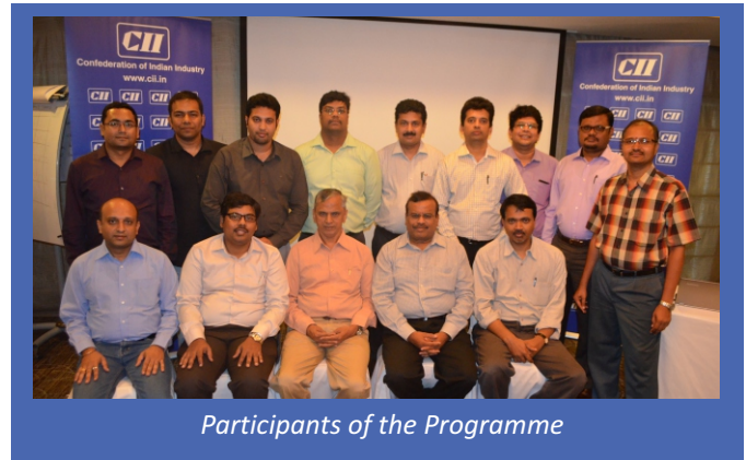
Participants of the Programme

The training program was structured in three segments; Self Assessment by participants on their current capabilities; an interaction call with participants on preparation before the program and Six Days Class Room training.