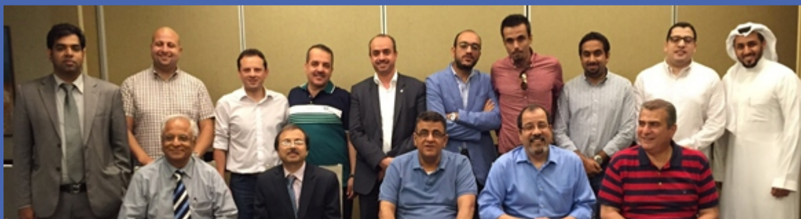
Senior Management participants of Gulf Medical Company, Jeddah in the 3 day Training Workshop on Enterprise Risk Management