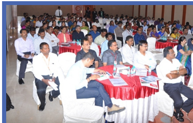
Engrossed delegates at the Higher Education Conclave (HEC) at Salem on 13 July