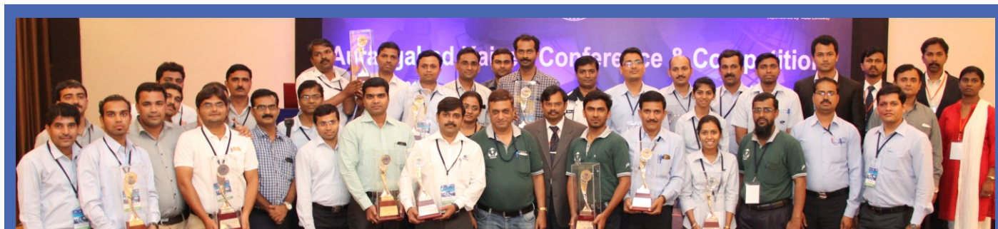
Winners of the Aurangabad Kaizen Competition