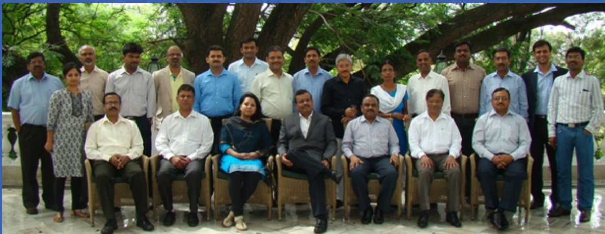
Participants in the Six Sigma Black Belt Certification Programme