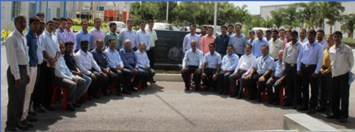
Members of the Study Mission to the Toyota Kirloskar Plant