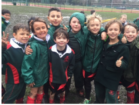
Yr 2 Muddy Football!