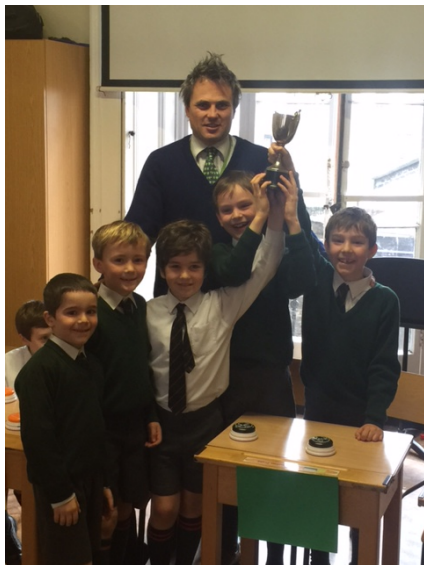
House Quiz – Green House Winners