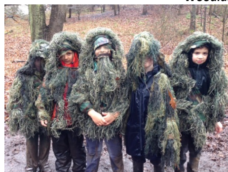
Woodland Adventure Day