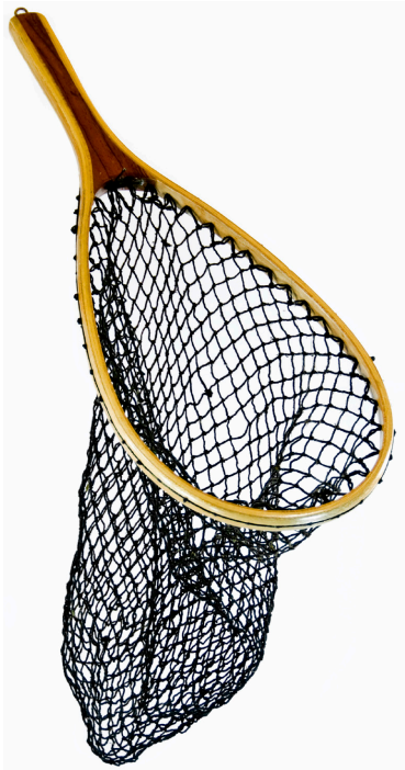
Figure 2. The fisherman's net with fine mesh is great for collecting larger aquatic invertebrates, including Cybister and Dytiscus diving beetles.

Light trapping is probably the least effective method for collecting diving beetles, but it does occasionally work. One way entomologists trap insects at night is by hanging a white sheet in front of a light and collecting the insects that fly to the sheet (see http://mississippientomological-museum.org.msstate.edu/collecting.preparation.methods/Blacklight.traps.htm#.Vij72PmrSHs ). Any bright light may attract a diving beetle at night, especially those that are near freshwater, isolated from other lights, and open to a large area.