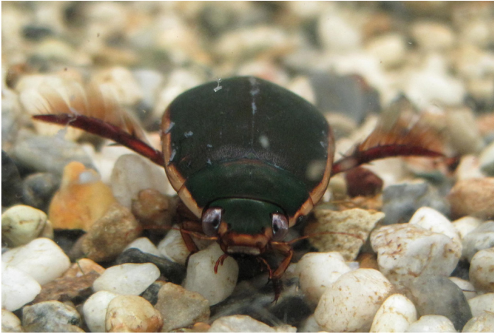
Figure 4. The giant diving beetle, Cybister fimbrolatus .

water bodies without fish, including roadside puddles and cattle tanks. Each beetle can live for several years. They are scavengers, and love earthworms, small pieces of meat, and dead insects. Sometimes they can catch a snail or another living aquatic creature. They are not very good at catching fish, but may succeed at night, so we do not recommend keeping beetles and fish in the same tank.