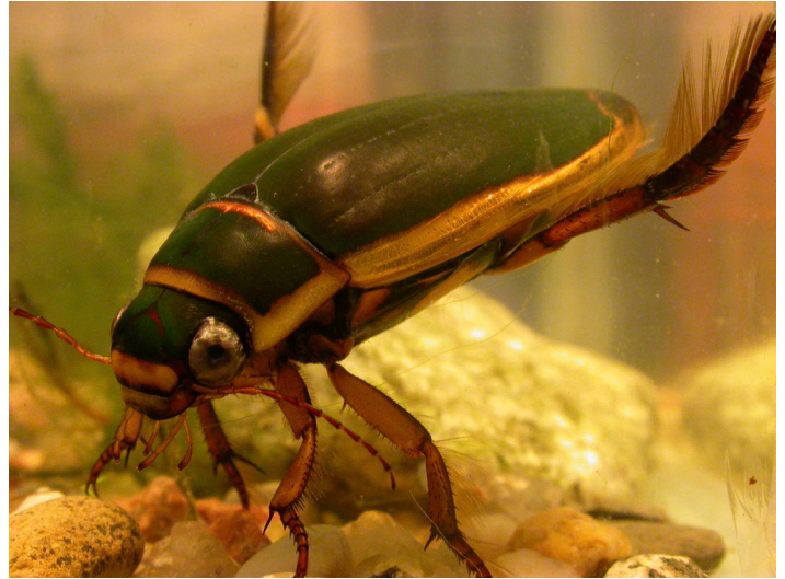
Figure 6. Dytiscus sp.

Various species of Dytiscus are also large and very beautiful. They can be collected in northern latitudes. Dytiscus spp. are all uncommon, and the only reliable way to collect those is using the diving beetle trap in Figure 3.