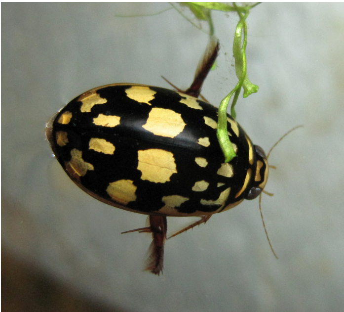
Figure 5. Sunburst diving beetle, Thermonectus marmoratus .

The sunburst diving beetle ( Thermonectus marmoratus ) is probably the best species for beginners. It is about 1–1.5 cm long and found in puddles and temporary streams in southwestern North America, even in relatively dry habitats. It is smaller than the giant diving beetle, but it is possibly the most beautiful species in the United States. This species is also exceptionally easy to keep and is active during the day, making it a delight to have in a tank. The