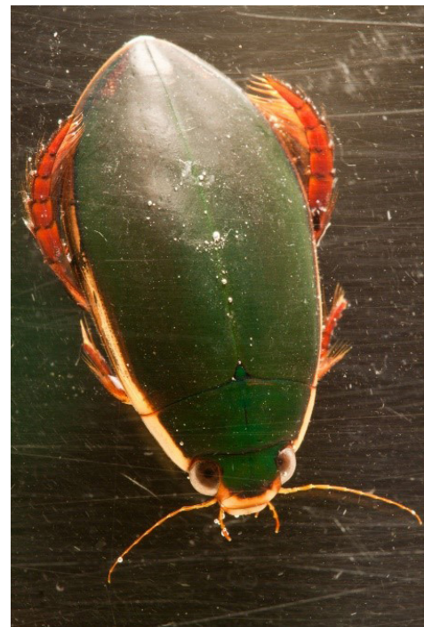
Figure 1. A Cybister diving beetle rests underwater.

beetles entertaining pets in aquariums. Most importantly, diving beetles are beautiful, dynamic, and interesting, and they need only minimal care!