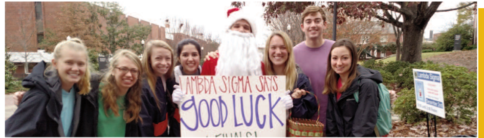
Santa with Pi members

Our major project for the year is Operation Tiger Dreams. We are working with the pediatric wing of the local hospital to help kids who are missing school and need to stay on track. There are two parts to this project. First, we will take our Book Wagon to the hospital and allow students to select books to read. They will be able to take these books home with them. The second part involves taking Auburn University t-shirts, cutting the back in half, stitching the cut edges, and sewing ties on each side so the t-shirt can substitute for the hospital gown. We have partnered with local t-shirt stores in this endeavor and have been quite successful. We plan to have Aubie, the Auburn University mascot, go with us when we visit with the Book Wagon and to distribute the modified hospital gowns. We are very excited about the service to the community and, in particular, these kids. ♦