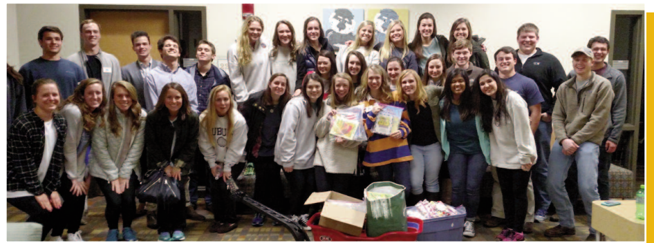
Pi members with their Book Wagon for a pediatric wing in a local hospital