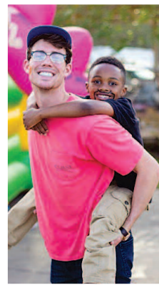
Alpha Iota member participates in the fall festival

youth. The afternoon included a variety of activities including festival games, face painting, crafts, kite flying, and a space jump. With all of the activities, most of the fun involved the volunteers playing with the children all afternoon. Every child was filled with joy and laughter that day, and the same went for the volunteers. The event was truly memorable! ♦