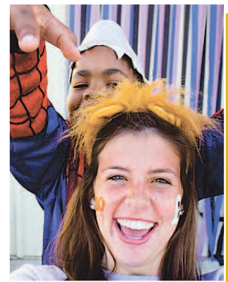
Enjoying activities with The Boys and Girls Club