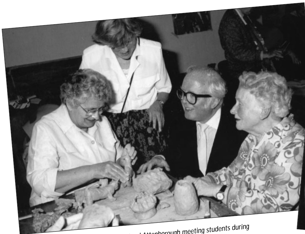
HANDS-ON EXPERIENCE: Lord Attenborough meeting students during an earlier visit to the Centre.

EXTRA • EXTRA • EXTRA • EXTRA • EXTRA • EXTRA • EXTRA • EXTRA • EXTRA • EXTRA