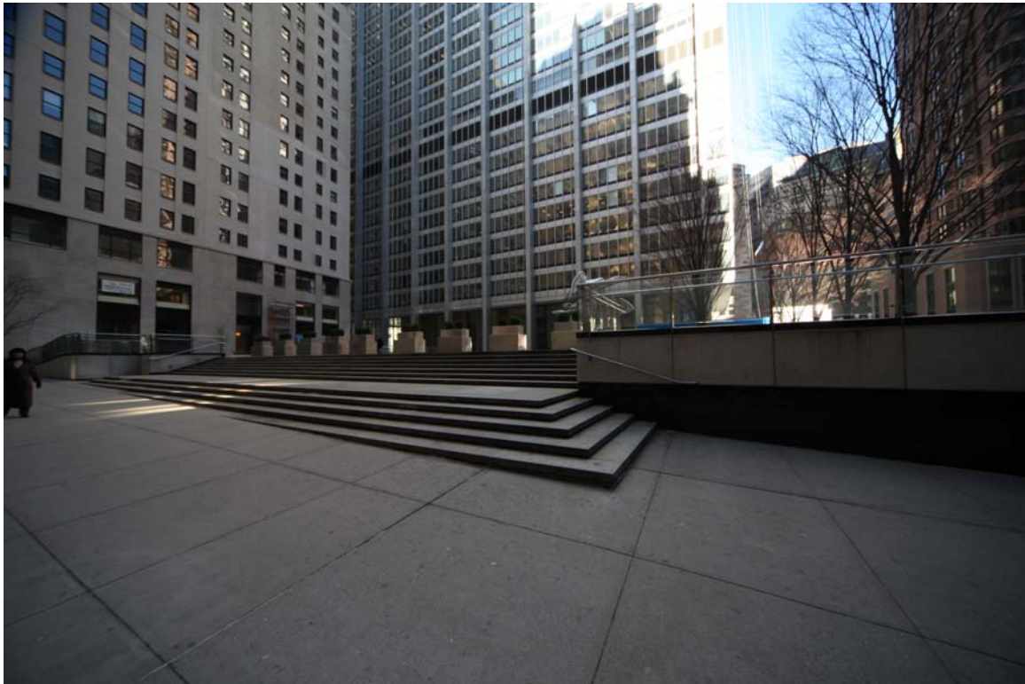
One Chase Manhattan Plaza South plaza, view towards northwest South entrance stairs, Pine Street