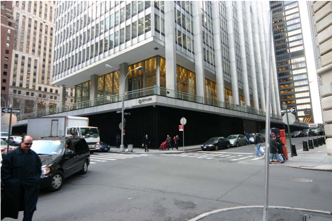
One Chase Manhattan Plaza Concourse Level, view north along William Street Concourse Level, corner of William and Liberty Streets