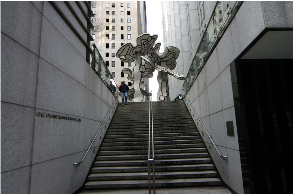
One Chase Manhattan Plaza Northwest & East Entrance Stairs