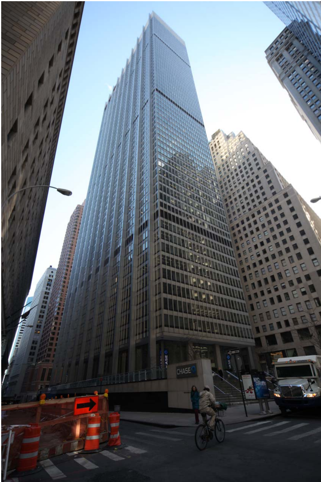
One Chase Manhattan Plaza View from corner of Nassau Street and Liberty Street