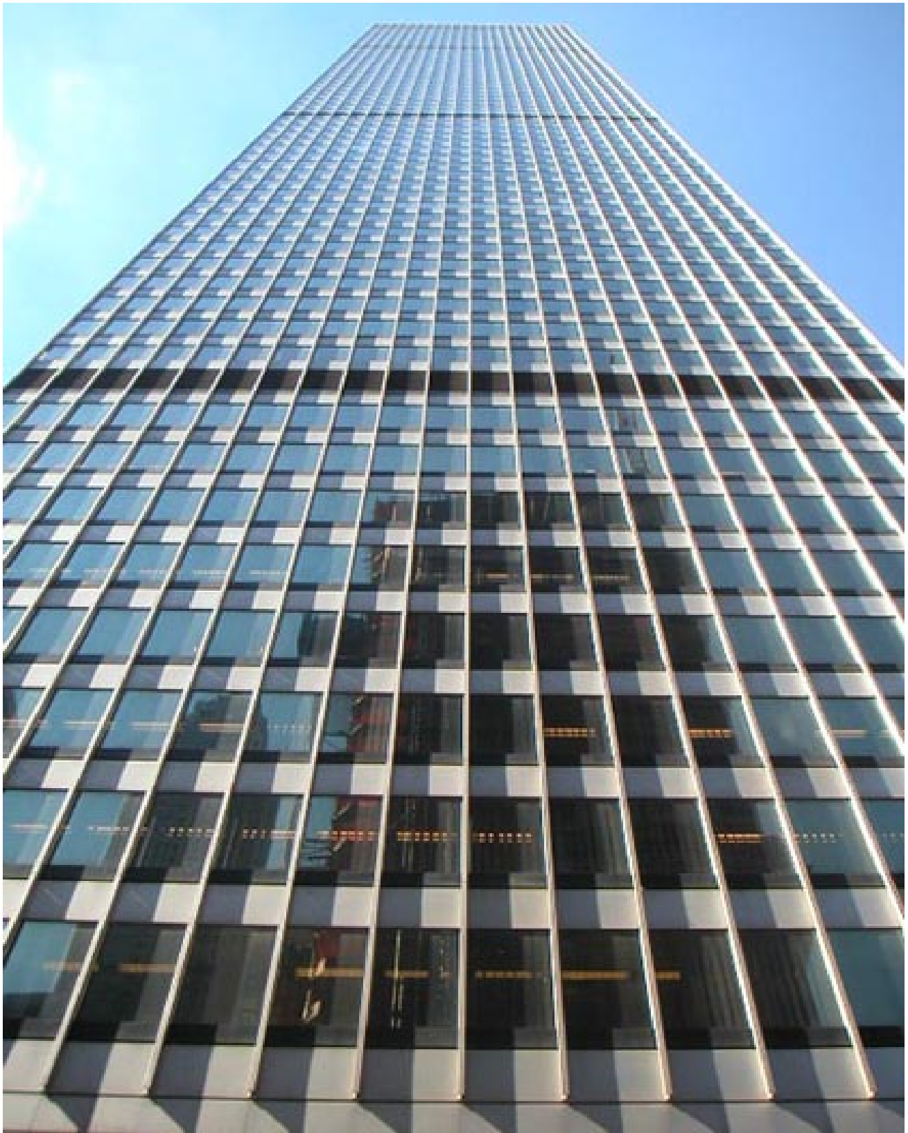
One Chase Manhattan Plaza , south elevation (aka 16-48 Liberty Street, 26-40 Nassau Street, 28-44 Pine Street, 55-77 William Street) Tax Map Block 44, Lot 1