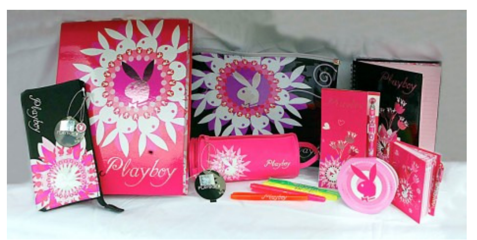
The Playboy range of stationery, which the company insists was not marketed at children, in spite of the fact that it was prominently displayed in Easons and Roches Stores in the back-to-school section.

A Fetish perfume advertisement, printed in teen magazines in the late 1990s, carried the tagline 'Apply generously to your neck so he can smell the scent as you shake your head 'no'.