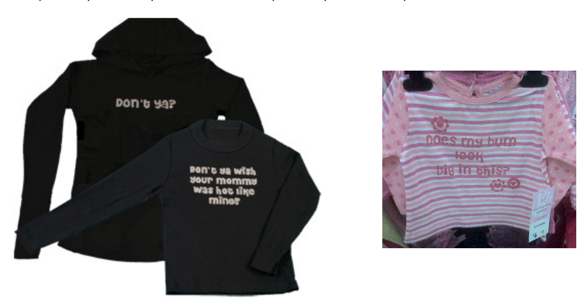
Clothing for toddlers and children bearing the slogans 'Does my bum look big in this?' and - inspired by the Pussycat Dolls - 'Don't ya wish your Mommy was hot like mine?'

In media studies, one of the key debates revolves around the extent to which audiences are influenced by or resistant to media messages. This is especially prevalent when it comes to representations of gender, where we have witnessed a return to polarized and highly stereotypical images of men and women in mainstream media in the past ten years. At one end of the spectrum we have the revamped macho men of Grand Theft Auto and, at the other, MTV's endless bevy of pouting 'babes' in hotpants. Many argue that the new repackaged images of male machismo and female submissiveness are performative or ironic, and that nobody takes them seriously. Notwithstanding the complexities of this debate, its terms of reference simply do not make sense if we are talking about children, who are not familiar with the 'backstories' of feminism, postfeminism or lad