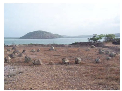
Figure 2. Stone circle, northern Cape York

increase ceremonies, which are the ritual component of a suite of activities that ensure the appropriate reproduction of the cosmos, including species of plants and animals. Ursula McConnel (who worked further south in Cape York) witnessed and recorded increase rituals in the 1920s, describing in detail their symbolic reference to fecundity and reproduction (McConnel, 1930-31).