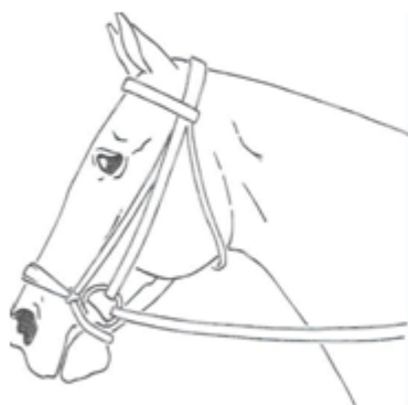
3) Dropped noseband