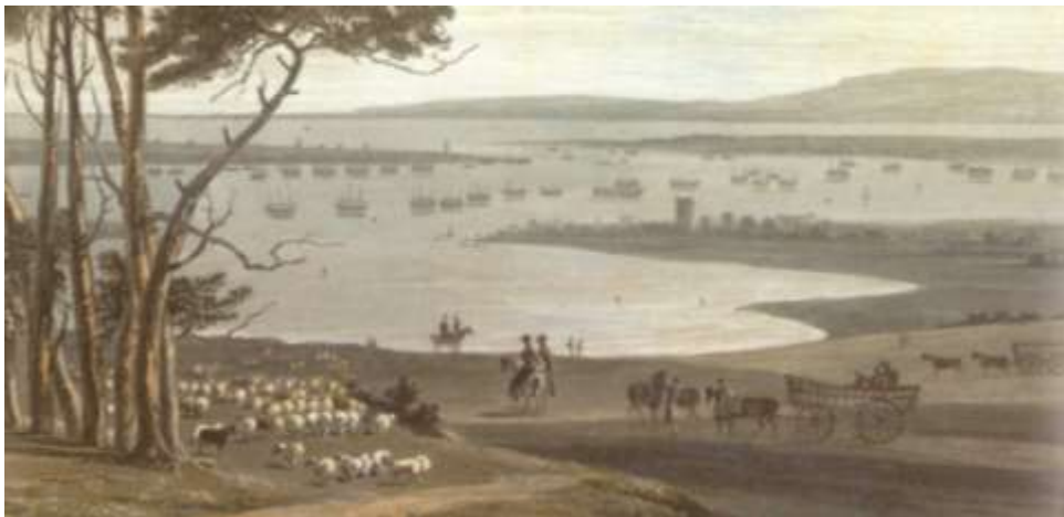
View over Portsmouth Harbour