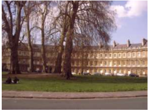
Hotel in Bath; easy departure for Heathrow airport or other tourist destinations