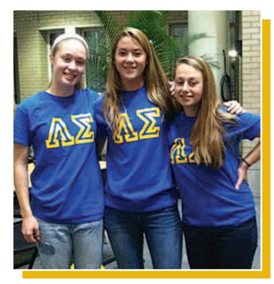
Alpha Psi Alumni continue service.

In order to further explore our mission to serve underprivileged children, we organized a few other projects around the holidays. Last year the chapter with the help of the Gannon Center for Social Concerns had the opportunity to