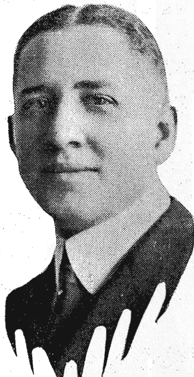
HARRY H. PACE