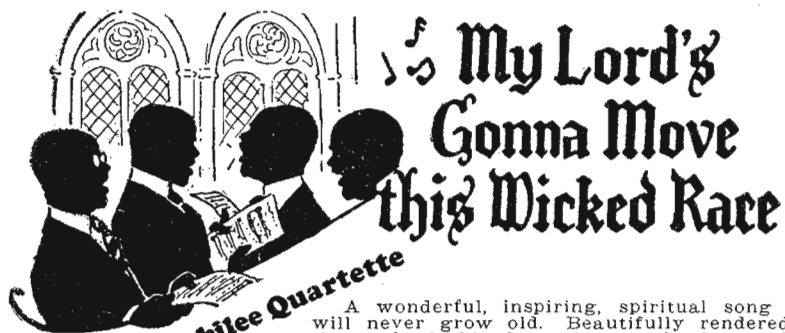
Norfolk Jubilee Quartette

A wonderful, inspiring, spiritual song that will never grow old. Beautifully rendered by the perfectly blended voices of the famous Norfolk Jubilee Quartette. It's a song that is sure to inspire you. Everyone who hears it will feel uplifted—just a little bigger and better in heart and spirit. Every Christian home will prize this record.