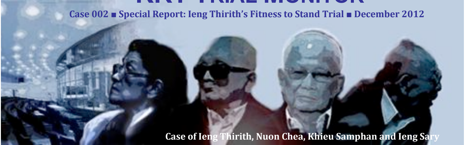
Case of Ieng Thirith, Nuon Chea, Khieu Samphan and Ieng Sary

Case 002 ■ Special Report: Ieng Thirith's Fitness to Stand Trial ■ December 2012