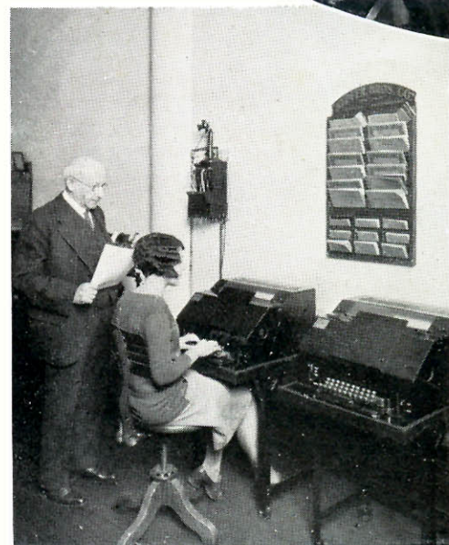
Oval shows equipment used by the Hazel-Atlas Glass Company between their Wheeling, W. Va., headquarters and sales offices in Chicago and New York.

A textile company with sales office in New York City and mills in North Carolina has used