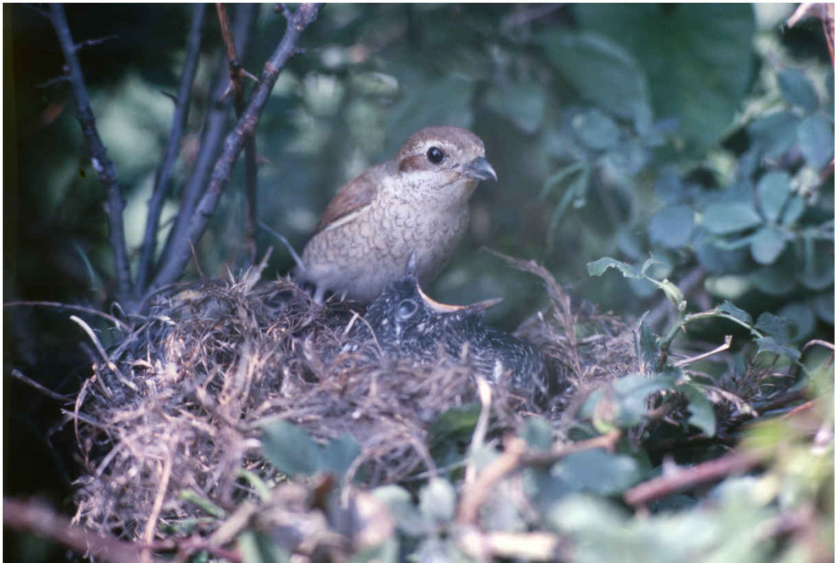
Figure 3. A young Common Cuckoo fostered by a Red-backed Shrike, 28 June 1985, Břeclav, Southern Moravia.

successful parasitism by the Cuckoo. Another explanation for the drop in parasitism is a decline of host numbers as explained below.