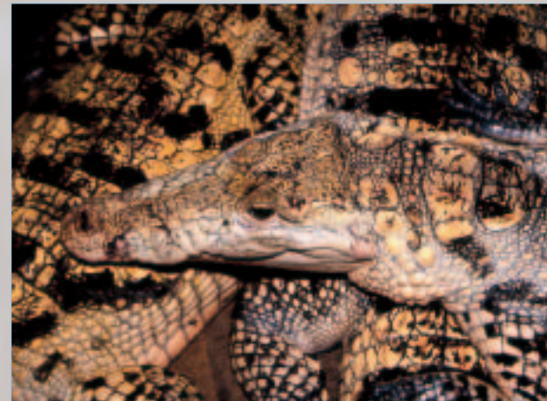
Hypomelanistic specimens of Crocodylus moreletii in captivity.

Morelet's crocodile, Crocodylus moreletii Bibron and Duméril, 1851, is a medium-sized species. Today adults rarely reach lengths of more than 3 meters, although it is possible that in the past they grew larger. ÁLVAREZ DEL TORO and SIGLER (2001) report having seen, in the late 1960s, exceptionally large skulls (left by skin hunters) decomposing in the rainforest — from their descriptions, I estimate that these crocodiles would have measured no less than 3.5 meters. The largest known Crocodylus moreletii is recorded as measuring 4.16 meters (PÉREZ et al. 1991), while MEREDIZ (1999)