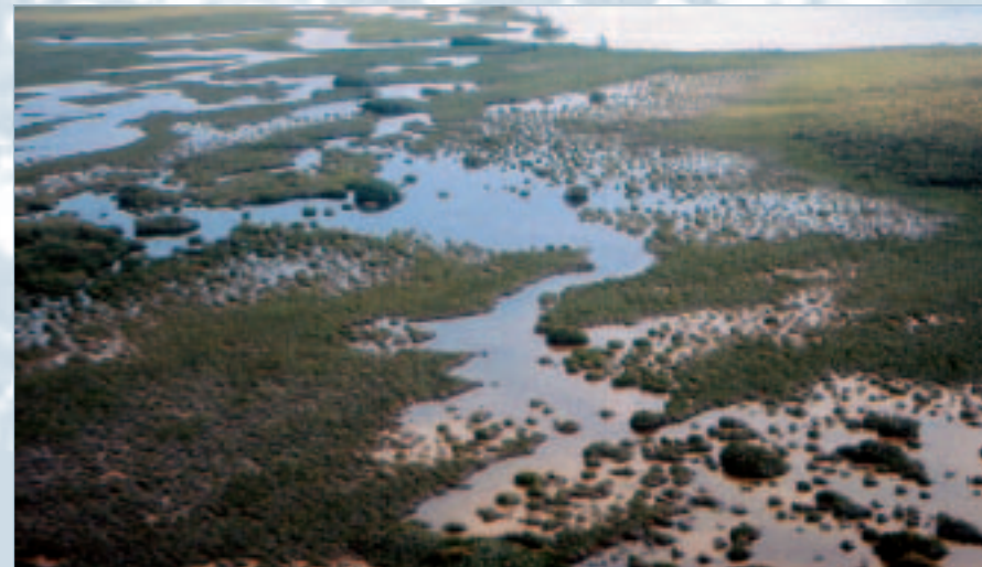
Flooded savanna on the Caribbean coast, habitat of C. moreletii . Quintana Roo (Mexico).

Hatchling crocodiles are prey to numerous wading birds such as the wood ibis ( Mycteria americana ), the jabiru ( Jabiru mycteria ), and the great blue heron ( Ardea herodias ). Birds of prey such as the roadside hawk ( Buteo magnirostris ) and the laughing falcon ( Herpetotheres cachinnans ) also capture small crocodiles when they get the chance. Several species of reptiles also hunt young Crocodylus moreletii , including the snapping turtle ( Chelydra serpentina ) and the indigo snake ( Drymarchon corais ) (ÁLVAREZ DEL TORO and SIGLER, 2001). Mammals such as the coati ( Nasua narica ), the raccoon ( Procyon lotor ) destroy the crocodile nests and eat the eggs, and the semiaquatic grison ( Galictis vittata ) captures and eats crocodile hatchlings. The tayra ( Eira barbara ), and especially the jaguar ( Panthera onca ) are able to kill and eat larger crocodiles. In areas where the two species of crocodiles are sympatric, larger specimens of Crocodylus acutus are able