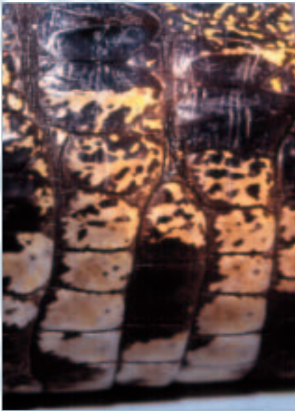
Lateral scales on the tail of C. moreletii . Note the vertical rows of scales that do not reach the large dorsal scales, a characteristic that distinguishes this species from C. acutus .