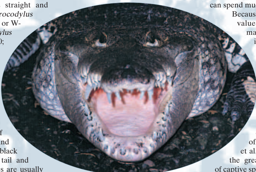
The jaws of C. moreletii .

Crocodylus moreletii is a hunter. Hatchlings seem to relish slugs and snails, but catch and eat whatever they can, including aquatic, terrestrial, or flying insects (ÁLVAREZ DEL TORO and SIGLER, 2001). Older specimens begin to catch small crustaceans and fish, frogs and other amphibians, birds, and small