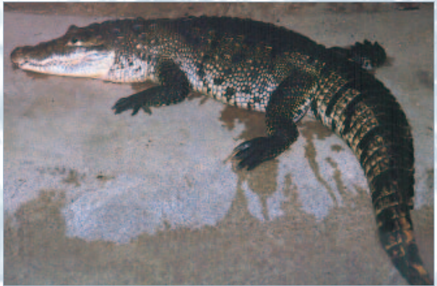
Juvenile specimen of Morelet's crocodile about to be released after having been captured as part of a population study at the Siam Ka'an Biosphere Reserve. Quintana Roo (Mexico).

would tend to rise. In any case, the particular circumstances of each region must be carefully studied to determine the feasibility of this kind of project, and other complementary projects. Morelet's crocodile is currently being successfully raised by numerous farmers and breeders.