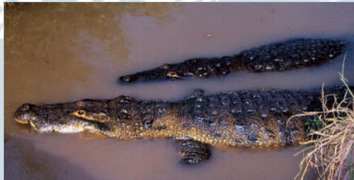
Male and female adults. Note the relatively short and broad snout typical of this species.