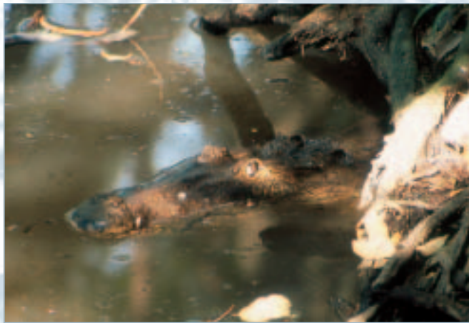
Male C. moreletii at the entrance of its cave (Guatemala).

Another morphological feature that distinguishes this species from the American crocodile is the relationship between the length and width of the head. Morelet's crocodile has a shorter and broader head. Also, the suture joining the maxilla and premaxilla bones of the upper jaw is straight and transverse in Crocodylus moreletii , but is V- or W-shaped in Crocodylus acutus (LEE, 2000; NAVARRO, 2002).