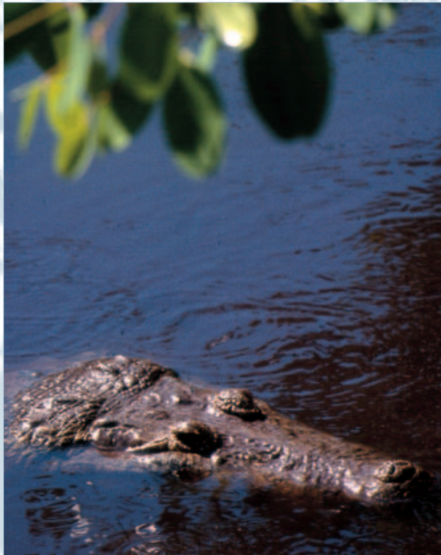
Adult male C. moreletii. Quintana Roo (Mexico).