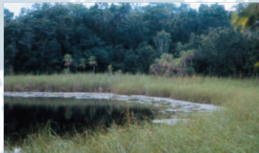
Bodies of water within the rainforest are important habitat for C. moreletii .