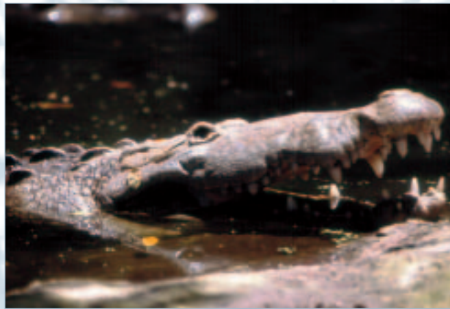
Adult C. moreletii. Quintana Roo (Mexico).