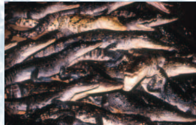
C. moreletii juveniles on a farm. Sinaloa (Mexico).

Although more information is needed, recent research seems to