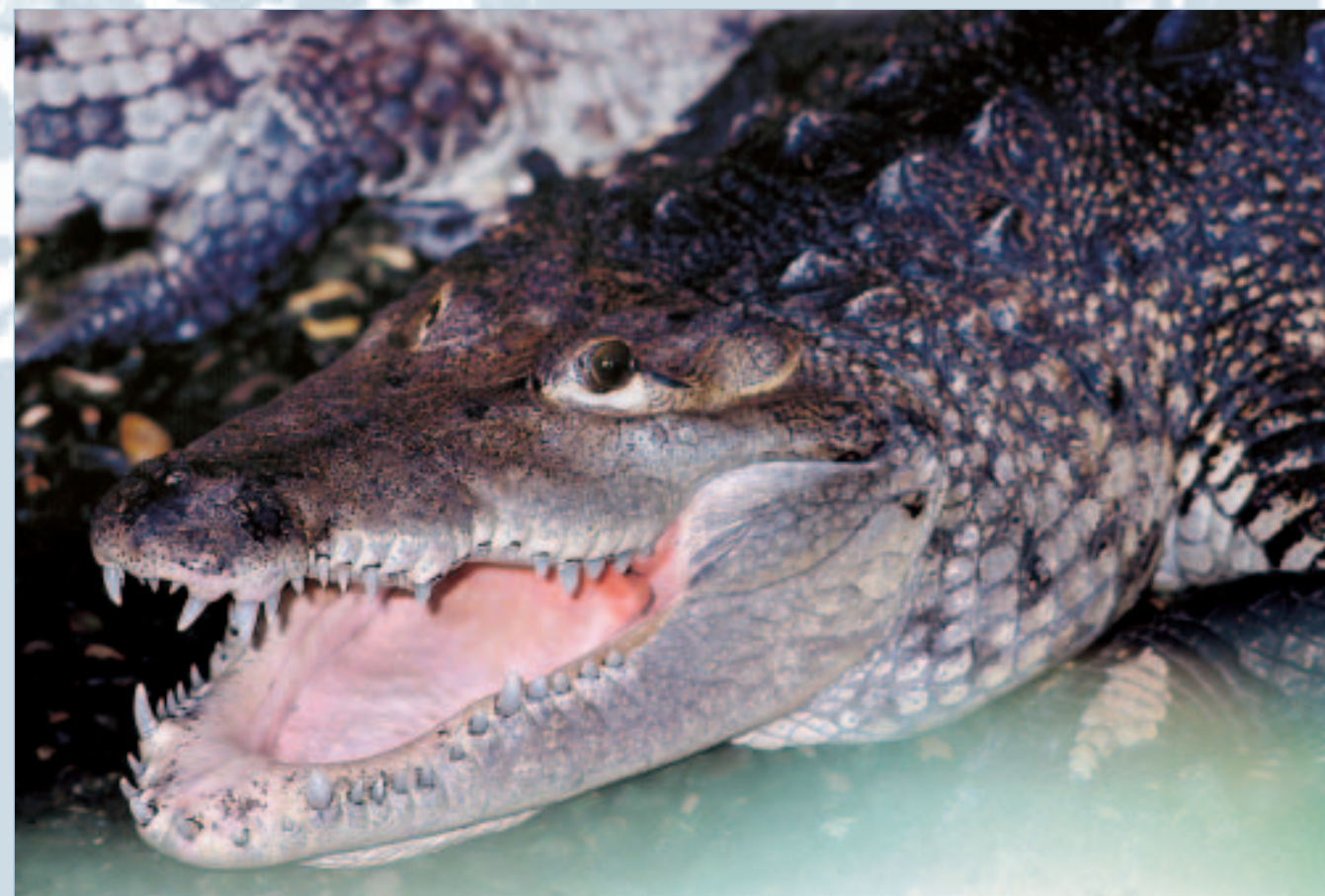
Close-up of C. moreletii.