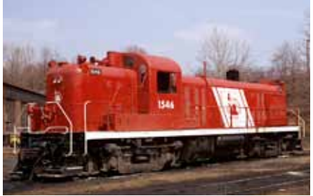
CNJ's final diesel livery was this nice red and white, exemplified by RS3 1546 in March '72.

Central Railroad of Pennsylvania was established in 1946 in a vain effort to shield Pennsylvania assets from heavy New Jersey taxation; it was dis-