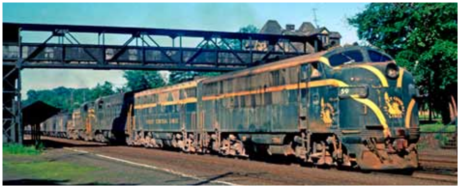
A "we ain't mad at nobody" diesel consist of F3A/F3B/H24-66/RS3 (that's EMD's, an FM Train Master, and an Alco) rolls eastbound freight through Fanwood-Scotch Plains, N.J., in the '60s.

ing & Lake Erie, and Pittsburgh & West Virginia replacing B&O.