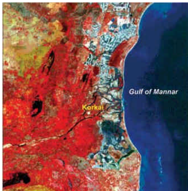
Figure 2. Satellite imagery of the study area.

a northern distributary of the delta, about 5 km northeast of Korkai.