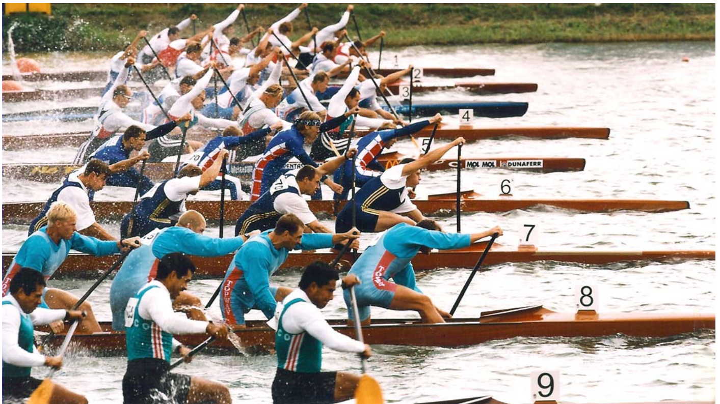
World Championships Flatwater Racing 1998 Szeged, C4 men 1000 m, Start