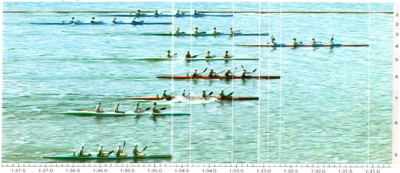
Women's K-4 500m Final