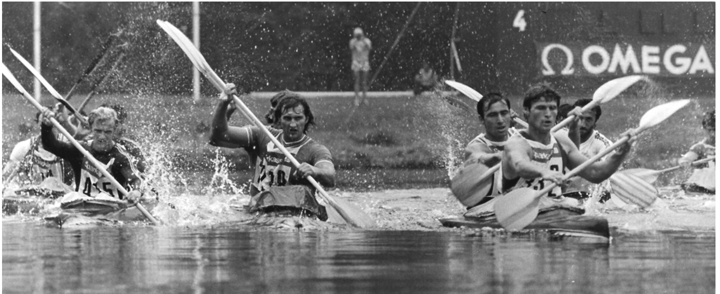
World Championships Flatwater Racing 1979 Duisburg, K2 men 10'000 m