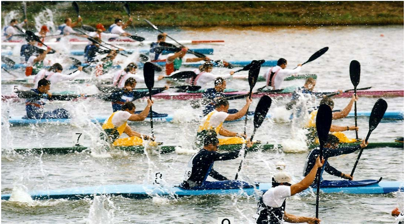
World Championships Flatwater Racing 1998 Szeged, K4 men 1000 m, Start