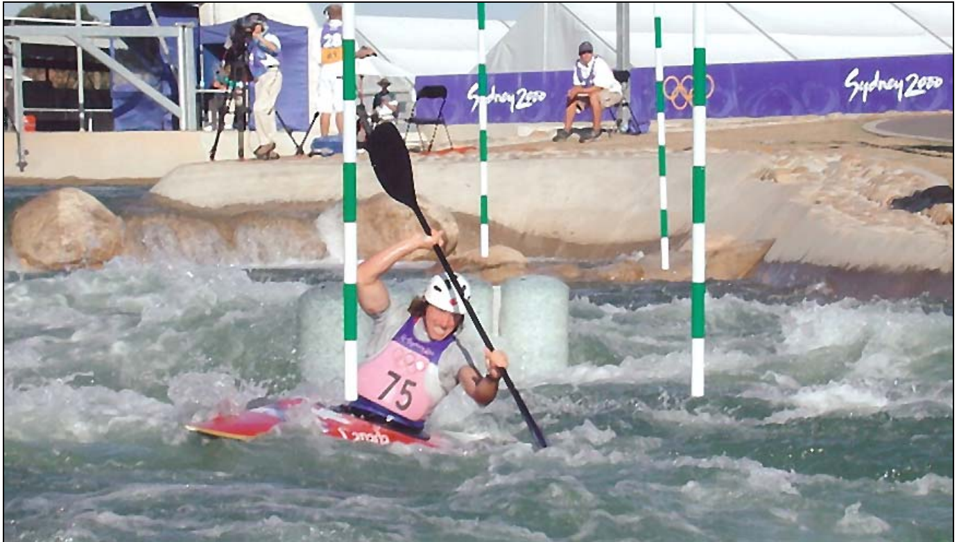
Olympic Games Sydney 2000, Canoe/Kayak Slalom Racing, K1 Men