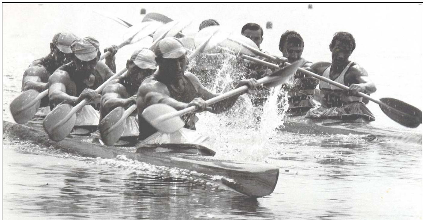
World Championships 1979 Duisburg, K4 men 10'000 m