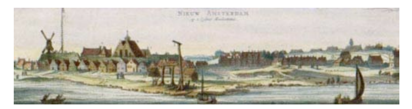
Early New Amsterdam on Manhattan

in the Spice Islands in eastern Indonesia (Banda Islands), where the local population was annihilated and replaced by natives from other islands that were more friendly towards the Dutch colonizers. The spice trade was of major importance to the Dutch trading empire of the East India Company (VOC) and ultimately the Dutch held on to six of the seven Banda Islands. The British were dug in on the seventh island, Run, near Banda Island and kept attacking the spiceladen ships that left from the beautiful natural harbour of the Banda Islands. Fighting wars on various fronts ultimately became too much for the small Dutch nation and with the final version of the Treaty of Breda in 1667, the Dutch traded the New Amsterdam colony and surrounding lands for the full ownership of the Banda Islands as well as ownership of Surinam in South America. The Indonesian islands were at the time of greater commercial importance than New Amsterdam