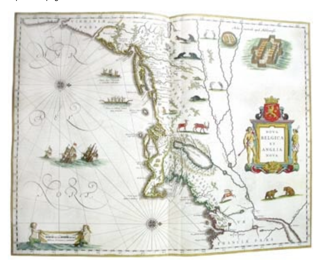
The 'Blaeu map' of 1635. North is pointing to the right on this map!

nonetheless Block set out from his winter lodgings to explore eastwards in the spring of 1614. He crossed the narrows in the East River, which he named the 'Hellegat', later recast as Hell's Gate (Hellegat literally means "hole from hell", so Hell's Gate is not that bad a translation). However, it is sometimes (wrongly) translated as "bright passage", as Helle also means 'intense light' in Dutch. The Hell's Gate narrows became a ship graveyard over time, so in 1876 engineers blasted away the most dangerous rocks, reputedly making the largest man-made explosion prior to the Hiroshima bombing.