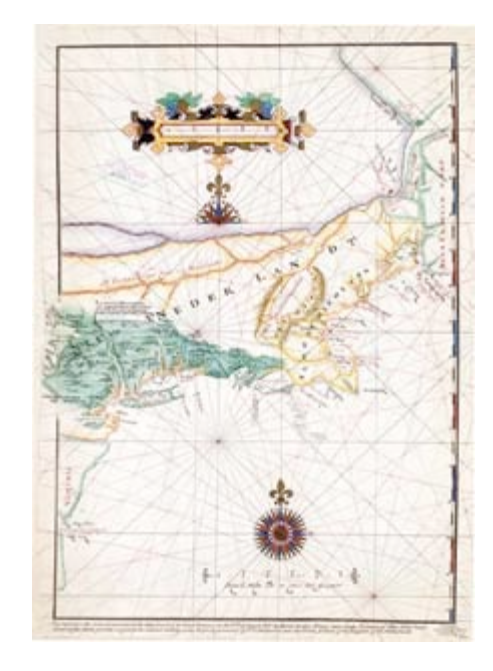
The 1614 'figurative map' of Adriaen Block.

Adriaen Block, a merchant who had made many previous sea voyages, sailed from Amsterdam to the Americas four times. The general assumption is that Block had already discovered Long Island Sound on one of his earliest trips, but he must have passed Rhode Island to get there. How he named Rhode Island is a matter of controversy, as he might have named Rhode Island 'het Roode Eylant' (Red Island), with the name later being bastardized to 'Rhode Island'. Others, however, think that the Italian explorer Verrazano named