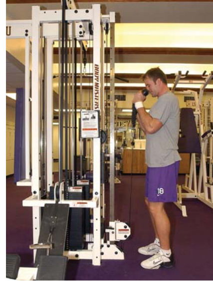
The Tigers lift three days a week, emphasizing explosive multi-joint movements and strength development.