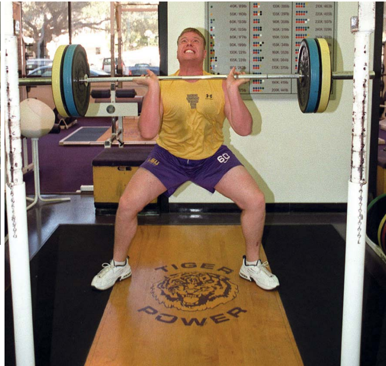
Power cleans are a core lift for the LSU Tigers.

soft-tissue technique that is revolutionizing athletic training, allowing injured athletes to return to the game much faster than with traditional sports massage techniques. "Active Release differs from sports massage in that it allows me to get sport specific, duplicating the same mechanics that occur in sports," says Burnside. "It also allows me to pinpoint certain areas that I couldn't with sports massage. We often use Active Release and other forms of soft tissue manipulation in conjunction with a progressive resistance exercise program for the best results."