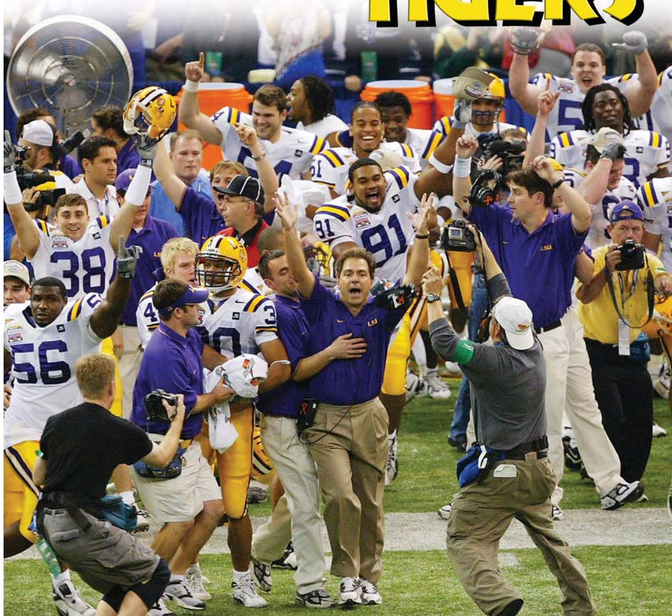
Head coach Nick Saban of LSU celebrates after defeating Oklahoma 21-14 to win the National Championship at the Nokia Sugar Bowl on January 4, 2004 at the Louisiana Superdome in New Orleans, Louisiana.