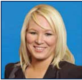
Minister Michelle O'Neill MLS