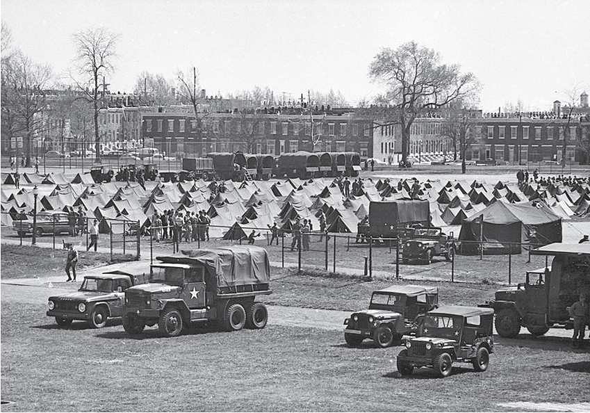
U.S. Army encampment in Patterson Park.