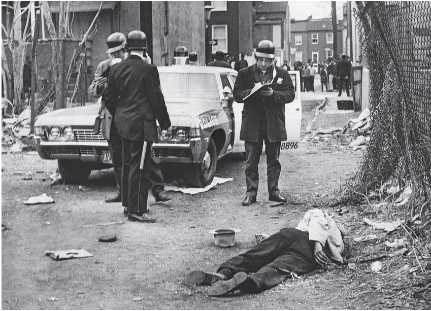
Suspected looter shot by police.