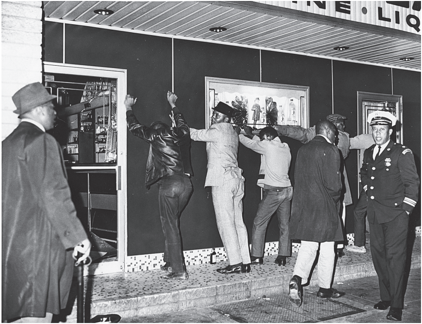
Baltimore police arresting suspected looters on Pennsylvania Avenue.