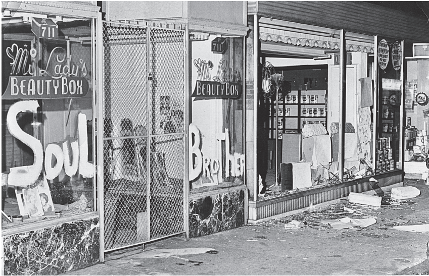
The “Soul Brother” sign—the apparent salvation of this beauty salon. The neighboring business did not fare as well.