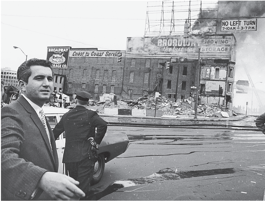
Mayor Thomas D'Alesandro III at the scene of a building fire.

a vacant house. According to one source, policemen on the scene were commanded to withdraw rather than confront the crowd, but this claim cannot be confirmed. There is no question, however, that about an hour later two new fires broke out at the Ideal and Lewis furniture stores in the 700 block of North Gay Street and that crowds continued to gather in East Baltimore. 17