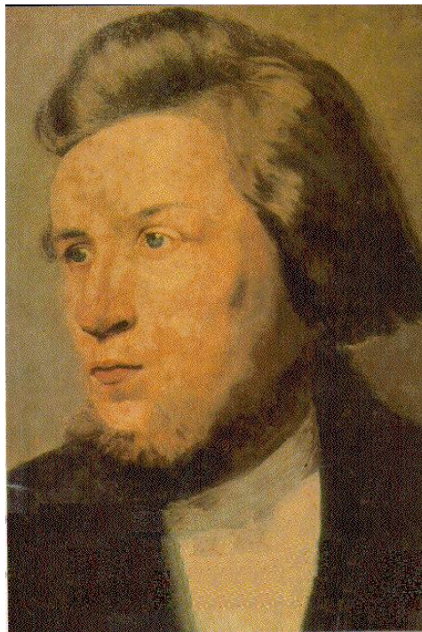
Hans Nielsen Hauge, painted in 1800