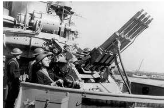
(Continued on page 5)

An interesting feature of the 1.1-inch mount is that in addition to being able to depress/elevate (-15 to +110 degrees) and train (360 degrees), the guns could also slew 30 degrees side to side. It was thought this feature would be helpful in tracking a dive bomber at high elevation angles. A platform was added so the loaders could feed the guns when the barrels were depressed as this raised the back of the guns up higher than the loaders could conveniently reach. At the other extreme, loading and firing the gun when it was elevated to 110 degrees (20 degrees past the vertical) must have been a challenge. One wonders if the trainer and pointer had seatbelts to keep from falling out of their seats.