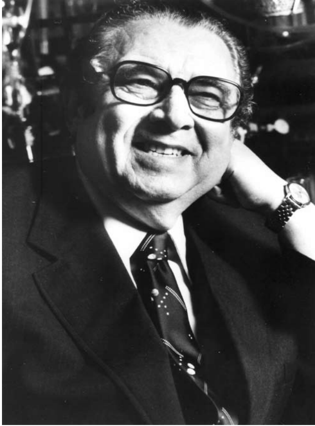
Photograph Credit Here.