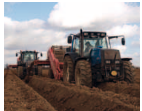
Rob's 8150 puts in a full day's work after 10,000 trouble-free hours.

As Jim says, "This is our second home – sometimes our first. Got to make it comfortable!" •