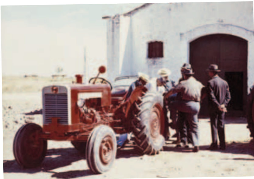
A Portuguese FAP 361 D. The technical specifications for the tractor were similar to those of the original Finnish model but with the addition of front and rear wheel weights due to the hard soil in Portugal. The three-cylinder engine produced 46 horsepower, and there were six forward and two reverse gears.