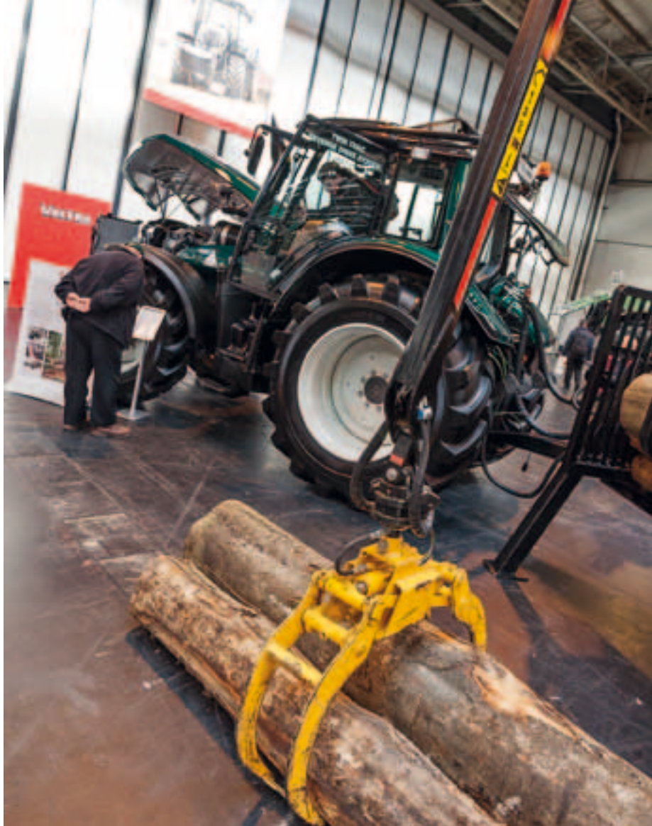
With Valtra's pedigree, the forestry exhibit created considerable interest amongst some. This model included TwinTrac.