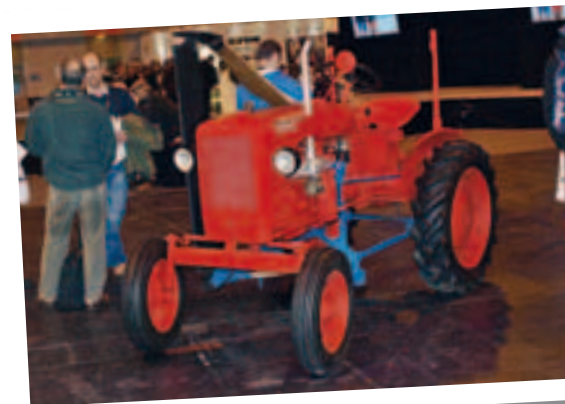
The Valmet 20, common in the 1950s provided a contrast with today's popular Valtras.