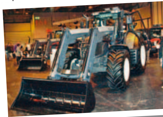
Several tractors, large and small were shown with loaders.