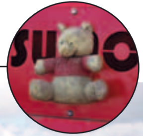
Teddy keeps an eye on operations.