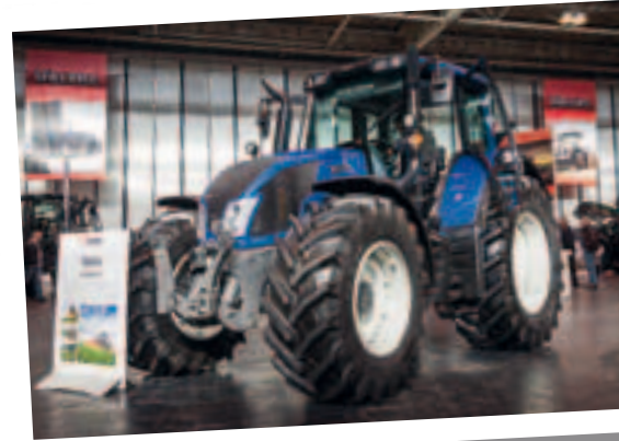
A wide range of tractors with a broad selection of specifications.

If you attended the show, I hope you enjoyed your day and found it useful; please let us know what you thought. If you were unable to attend, you missed a cracking good event. Keep your eyes open for a similar show in the future – Valtra at Discover AGCO should not be missed! •