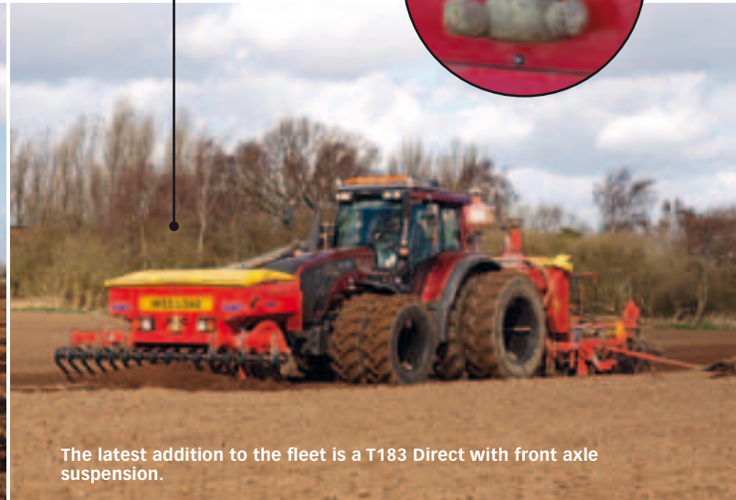
The latest addition to the fleet is a T183 Direct with front axle suspension.

In addition to lower fuel consumption, reliability has also been impressive. None of Rob's Valtras have needed a spanner on them other than for servicing. "And that's a really simple job we do ourselves. We've also changed belts," Rob notes.