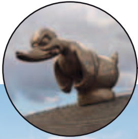
The Duck pushes on with the job.