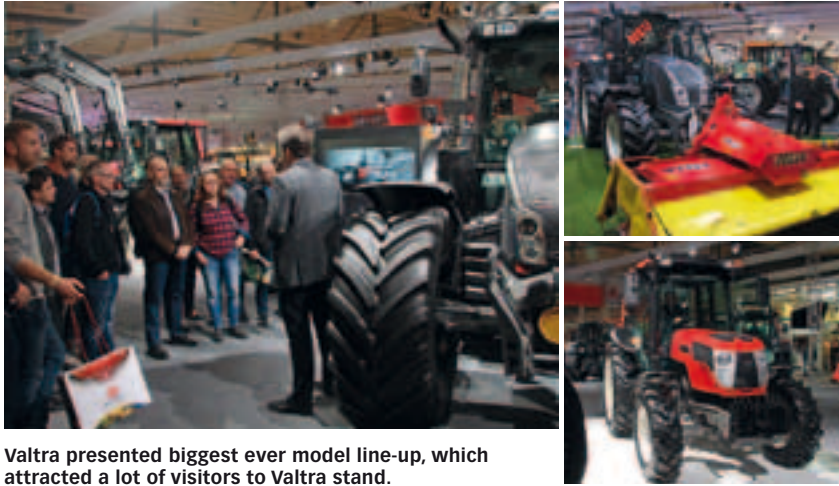
Valtra presented biggest ever model line-up, which attracted a lot of visitors to Valtra stand.