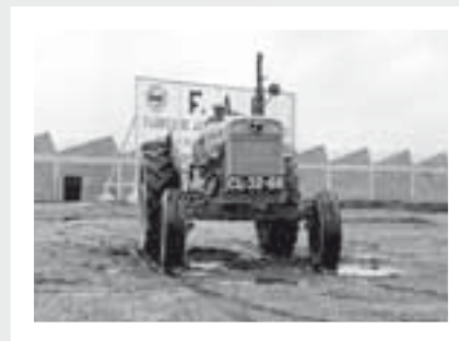
The factory was built in the town of Aveiro near Porto. Over 700 tractors were assembled at the factory for the Portuguese market.

In total, 734 FAP-Valmet 361 D tractors were delivered to Portugal